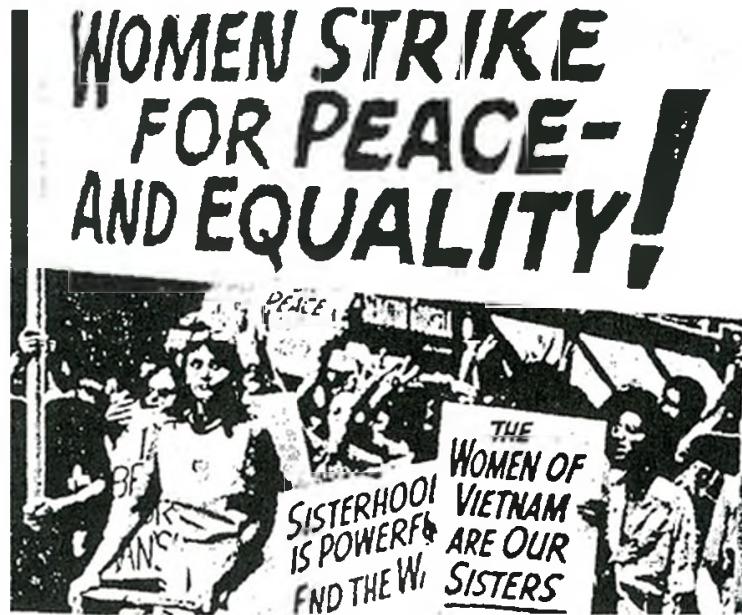
The Women's Strike for Equality, August 26, 1970, New York City.

have undoubtedly been going in for feminist reasons also, as they are still challenging eons of “gender and defense” tradition, and every woman who is doing it is to some extent a pioneer asserting women's right to equality with men.