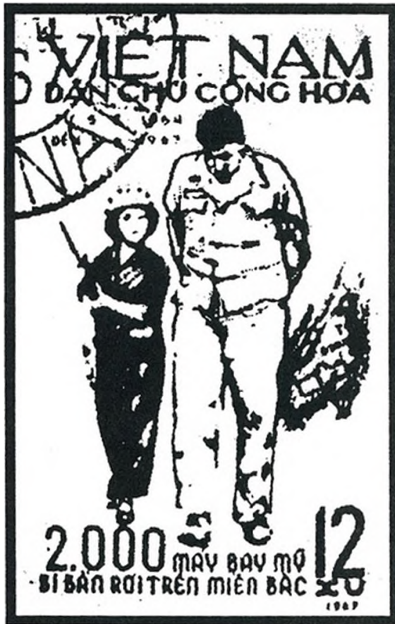
North Vietnamese postage stamp, 1967. Militawoman and captured U.S. bomber pilot. Courtesy of Redstockings Women's Liberation Archives.

North Vietnamese photograph of militia woman with a captured U.S. airman. It is said to be the most popular photo in a war exhibit in Hanoi. The photo was originally released by Hanoi in January, 1967. NO MORE FUN AND GAMES: A Journal of Female Liberation (No. 5), July 1971. Courtesy of Redstockings Women's Liberation Archives.