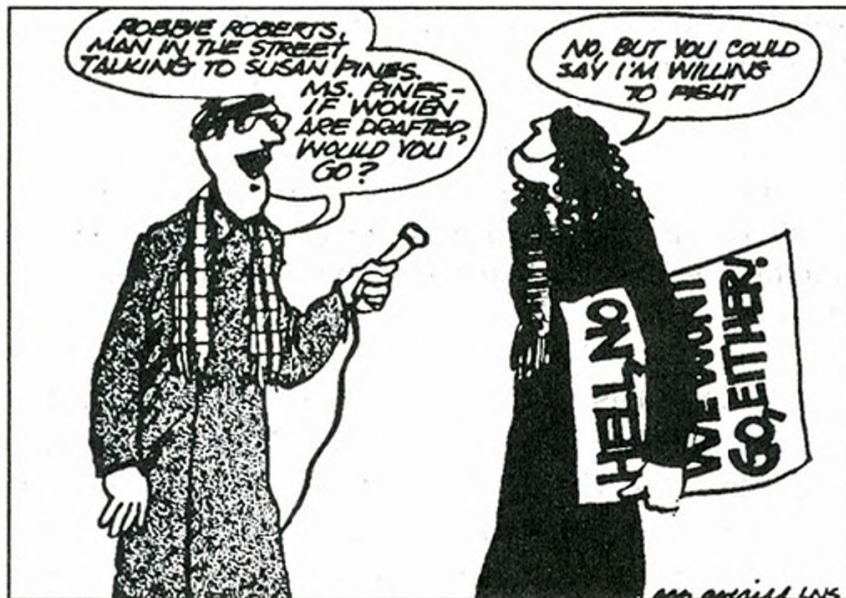
Peggy Averill, Liberation News Service cartoon, Delaware Alternative Press, Newark, DE (April, 1980).

The apparently imminent prospect conjured up whole new and uniquely powerful, inflammatory images of what a new resistance to an unjust war might be like under the new conditions—as the cartoons by Peg Averill of Liberation News Service illustrate. (Liberation News Service is one of the still living “counter-institutions” from the Sixties.)