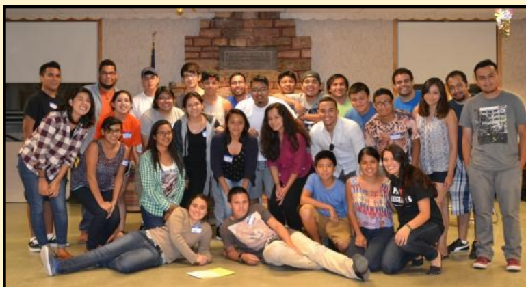
PICC's 2015 Youth Leaders

If you are interested in engaging your students with PICC, or another La Salle community partner, through service-learning please email carrlemke@lasalle.edu . A full list of our community partners can be found on our website: http://wp.lasalle.edu/cel/