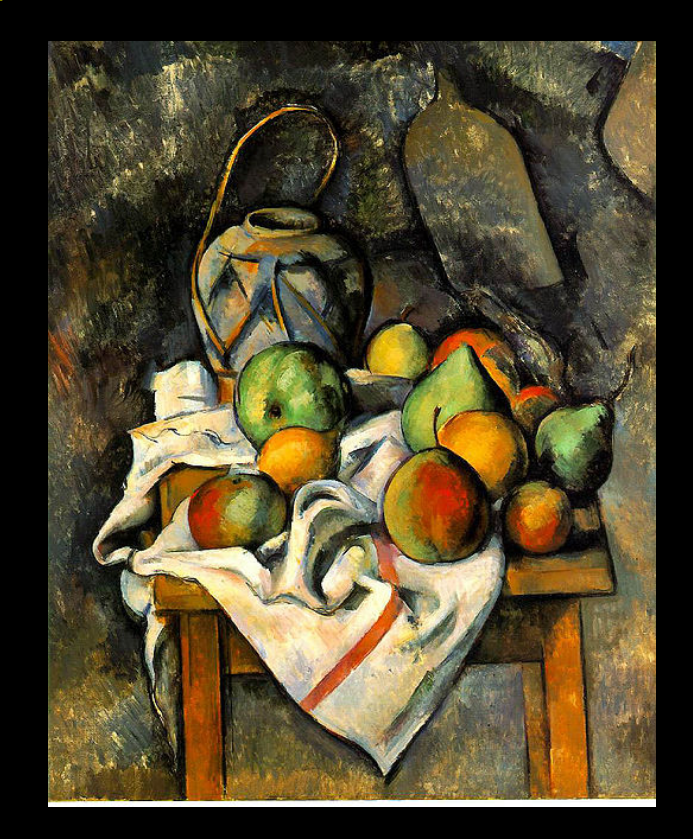
Paul Cezanne, Ginger Pot, c. 1895

"Basically I don't think of anything when I paint. I see colours. I strive with joy to convey them onto my canvas just as I see them. They arrange themselves as they choose, any old way. Sometimes that makes a picture. I'm a brainless animal..." -Paul Cezanne