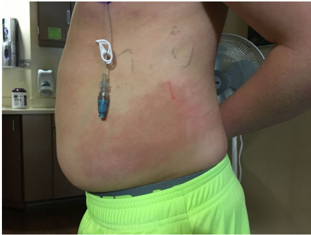
FIGURE 1 Left sided erythematous abdominal plaque

patches on his abdomen and upper right arm (Figure 1). Workup was initiated for septic emboli and was negative. New lesions continued to erupt, with expanding size of previous lesions. This included a large plaque on the left abdomen/flank where his previous abdominal pain was located. Further history revealed that a similar lesion occurred on his left chest wall after his second cycle of chemotherapy during an admission for febrile illness and resolved after discharge (Figure 2). Chart review revealed that the patient had received pegfilgrastim twelve days prior to the onset of his current skin lesions and within eleven days of his initial eruption (Table 1). He received doxorubicin and ifosfamide in his first two cycles of chemotherapy and ifosfamide alone during his third cycle of chemotherapy (Table 1). During his hospitalization, he received cefepime for a total of six days and vancomycin for a total of three days. Despite broad-spectrum antibiotics, he remained intermittently febrile and laboratory