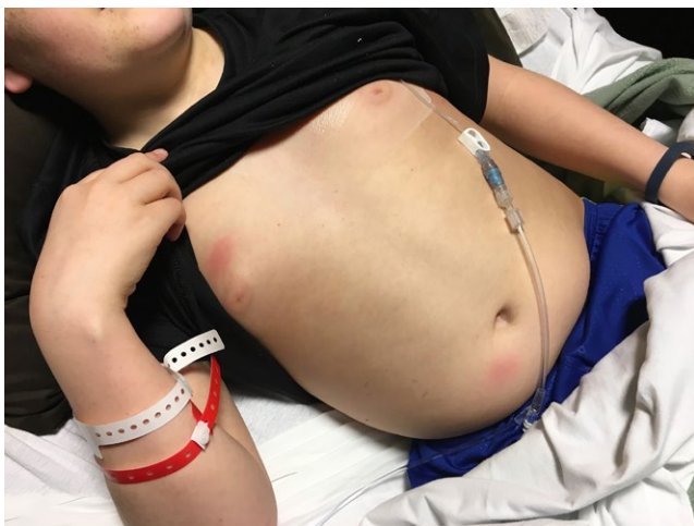
FIGURE 2 Erythematous plaques on right chest and lower abdomen which developed during previous hospitalization 11 d after G-CSF administration

patches on his abdomen and upper right arm (Figure 1). Workup was initiated for septic emboli and was negative. New lesions continued to erupt, with expanding size of previous lesions. This included a large plaque on the left abdomen/flank where his previous abdominal pain was located. Further history revealed that a similar lesion occurred on his left chest wall after his second cycle of chemotherapy during an admission for febrile illness and resolved after discharge (Figure 2). Chart review revealed that the patient had received pegfilgrastim twelve days prior to the onset of his current skin lesions and within eleven days of his initial eruption (Table 1). He received doxorubicin and ifosfamide in his first two cycles of chemotherapy and ifosfamide alone during his third cycle of chemotherapy (Table 1). During his hospitalization, he received cefepime for a total of six days and vancomycin for a total of three days. Despite broad-spectrum antibiotics, he remained intermittently febrile and laboratory