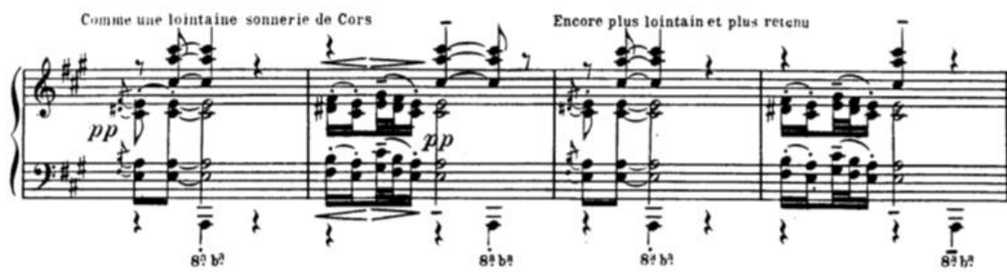
Example 15 “Les sons et las parfums tournent dans l’air du soir,” mm. 51–54

Debussy reflected the structure and imagery of the poem through harmonic language, texture, and musical indications, including dynamics and musical terms in this piece. He gives a specific marking to indicate the tempo, like En retenant (holding back) followed by à tempo (original tempo); serrez un peu (quicker) followed by retenu (held back); cédez (relax the speed) and rubato followed by Serrez (tighten), then rubato . Those markings seem to imitate the fading of air and scents, while the sound of pentatonic scales and parallel motions create a mystical image. As Paul Roberts argued “To appreciate ‘Les sons et les parfums tournent dans l’air du soir’ is to hold the key to a central aspect of Debussy’s genius.” 55