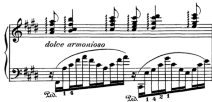
Example 7 Vallée d'Obermann , m. 180