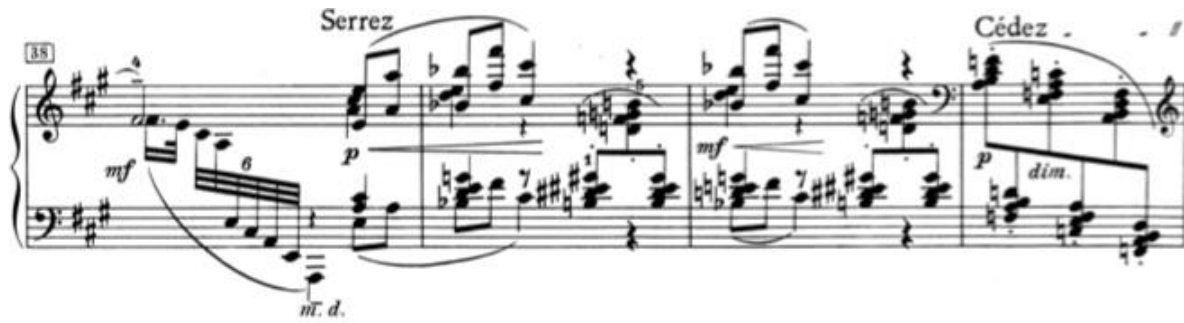
Example 13 “Les sons et las parfums tournent dans l’air du soir,” mm. 38–41

The opening two bars have apparent rhythmic ambiguities. The time signature in the opening creates confusion with irregular beats and the dynamic markings stress the moving tempo, while the “hairpin” marking makes the stress fall on the third beat of the first measure (see Example 12). 52 Moreover, the two-note slur on the fifth beat of the first measure and the first beat of the second measure make the stress falls on the fifth beat of the first measure. The harmonies of the two opening bars remain unresolved. The music begins with an A major triad, then moves towards a striking E-half diminished-seventh chord, perfect fourth, a diminished second followed by a tritone. The first phrase ends on an A-major thirteenth chord in measure 3. The rhythm and the harmonies suggest a waltz feel with strange, broken bar lines. 53 This seems to reflect the “melancholy waltz” and also create a feeling of “sweet-drunkness.” A similar harmonic passage later reappears in measure 27 in A-flat (see Example 14).