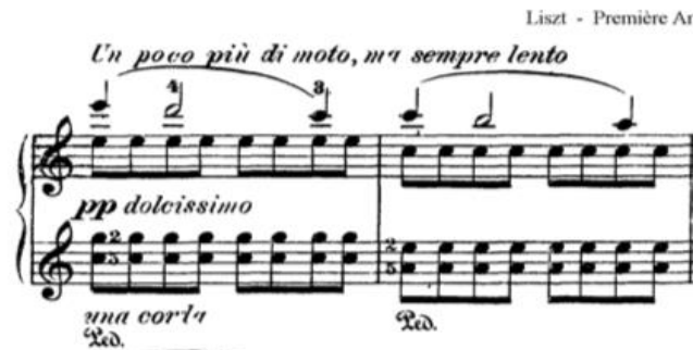
Example 2 Vallée d'Obermann , mm. 75–76

The second thematic transformation (see Example 3) coincides with a low tremolo. The three-note motive, in augmentation, is carried by the octaves above the tremolo accompaniment in the left hand, creating a nervous intensity. Moreover, in the following quickly oscillating octave passage (measure 139), he uses tempestoso (stormy) to emphasize the emotional quality of the music, which seems to depict Sénancour’s “ungovernable desires.” 22