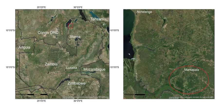
Figure 1. Mantapala in the Luapula Province, Zambia.

Mweru, which marks the boundary to the Democratic Republic of Congo. It is about 1100 km north of the capital Lusaka and 250 km north of the provincial capital Mansa. The lack of infrastructure (roads, financial services, trade, electricity, etc.) poses the main difficulty in the district. The area is located at an altitude of approximately 807 m above sea level and has a tropical climate with three seasons: winter (May-August), dry (September-October) and rainy season (November-April). Average monthly temperature does not vary greatly throughout the year, with an average of about 24°C, but daily fluctuations can be large with lows of 11°C in the winter and highs of 34°C in the hot season. Rainfall follows a seasonal pattern, with a peak of 2700 mm in the rainy months and close to 0 mm during the dry months [61] [62].