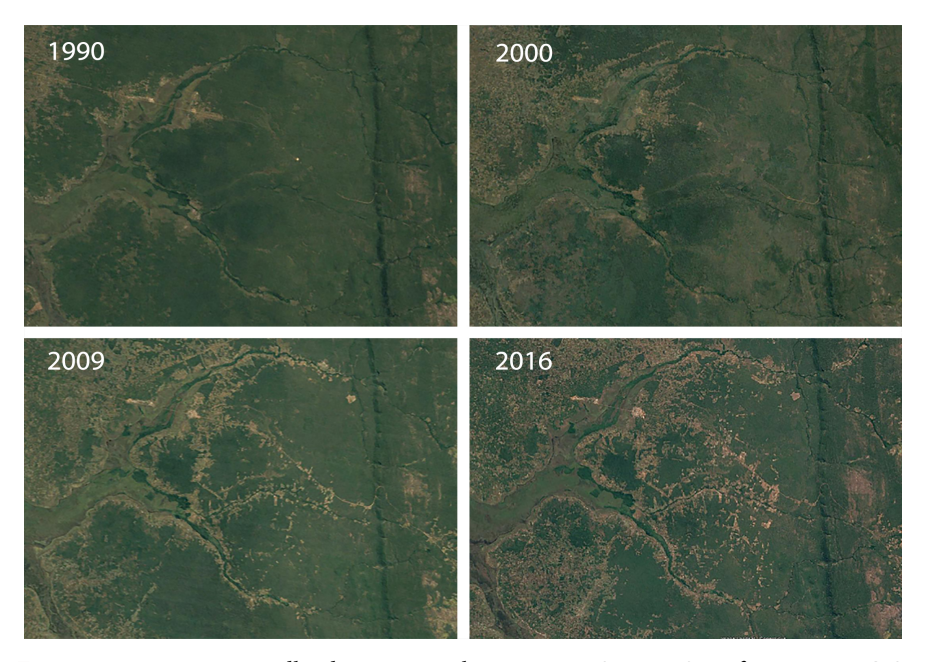
Figure 3. Decreasing woodland in Mantapala over time.

converting it to a suitable combustible form. Bundles of dried culms are carbonized whilst using a converted 200-liter oil drum as a carbonizing kiln. A large hole in the top of the drum and a number of smaller holes in the base allow for airflow during the initial combustion of the biomass. The majority of the volatile organic compounds in the papyrus burn off during the initial stages of the combustion. Once the papyrus reaches carbonization temperature (~450°C), the kiln is sealed to create an anaerobic environment to produce charcoal. The cooled carbonized papyrus is crushed by hand and mixed with a 5% - 10% by weight binder of cassava flour in heated water to create a porridge-like consistency. Afterwards, it is formed into cuboid briquettes using a simple press manufactured locally from scrap materials [7] [44].