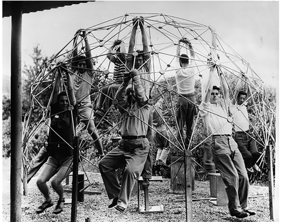
[Fig. 6]. Students constructing the geodesic Dome, Black Mountain College, 1949.

In parallel to this change in methodology, in 1975, a Ministerial order was approved whereby all technical degrees had their studies extended from 5 to 6 years. This decree forced all the Spanish Schools to draw up new curricula. Thus, in the 1975-76 academic year, a double change took place in the teaching at the Seville School. Firstly, the new curriculum began to be taught and the Workshops were implemented in the higher years. This new curriculum contained the same subjects of Projects as the previous one, it was just moved by a year, Elements of Composition passed from the second to the third, and Projects 1, 2 and 3, from the third, fourth and fifth, to the fourth, fifth and sixth. This is why the new teaching methodology implemented in the 1975-76 academic year was maintained throughout the duration of this curriculum, ending with the entry of Plan 98, which did substantially change the subjects to be taught and their teaching load, and which also served to operationally adjust a Department that had grown considerably in the twenty years since “Plan 75”.