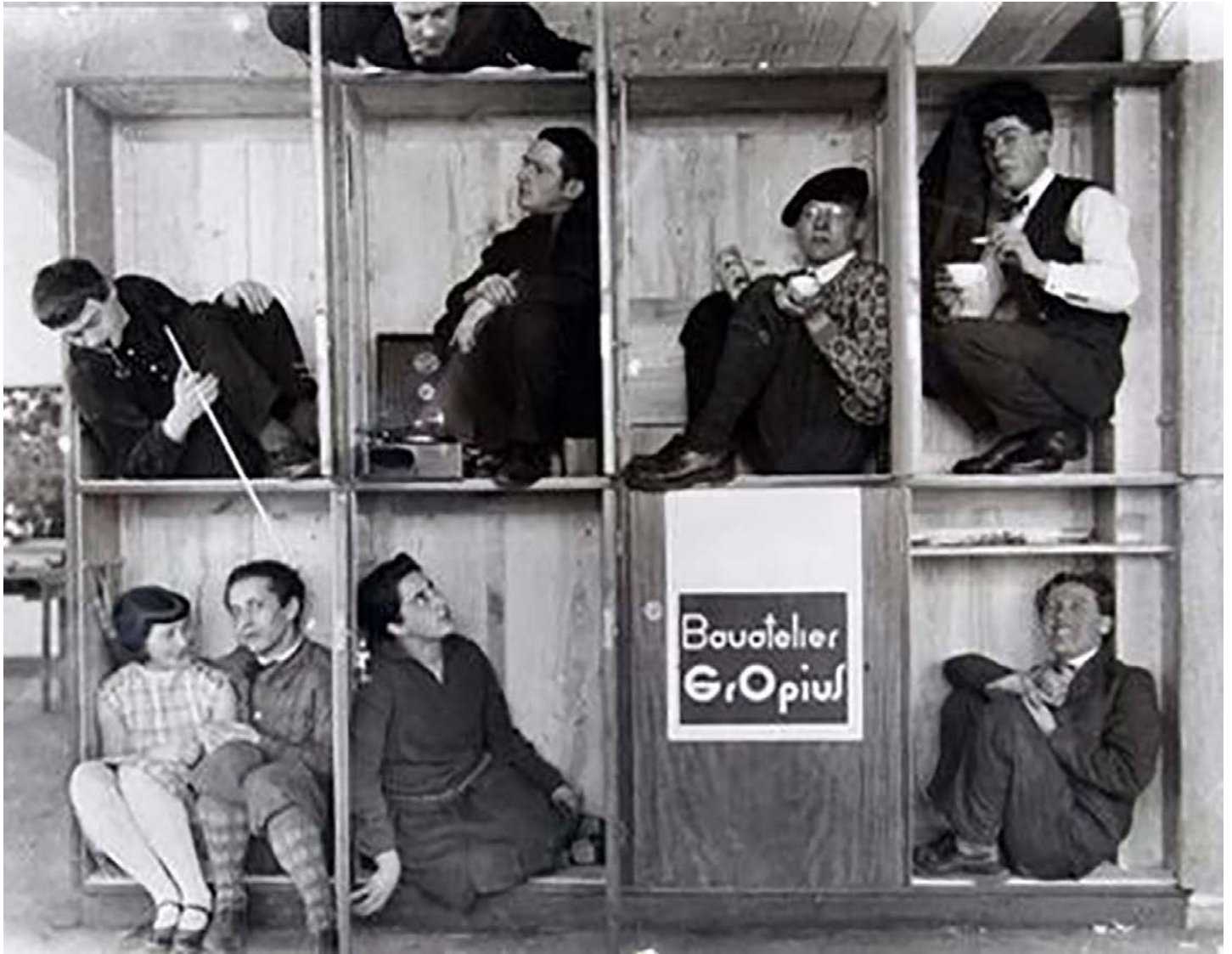
[Fig. 1] Students of Gropius in the Bauhaus of Dessau, L C S Skanderbegh, 1928.