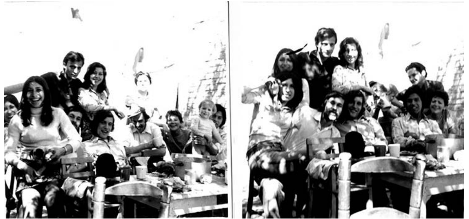
[Fig. 5] Students of Taller Total 11 in Colonia Lola, Buenos Aires (Argentina), 1972.

The Taller Total sought a totally practical teaching, with a horizontal and vertical structure of the different areas of knowledge into which the curricular structure had been divided, eliminating the previous system of Chairs, and dividing the teaching into two blocks, the Taller Básico , also called Elements of Architecture, for the first year, and the Taller Total , for the other levels. In the FAUC, 12 Workshops or Work Teams functioned with this methodology, with disparate success.