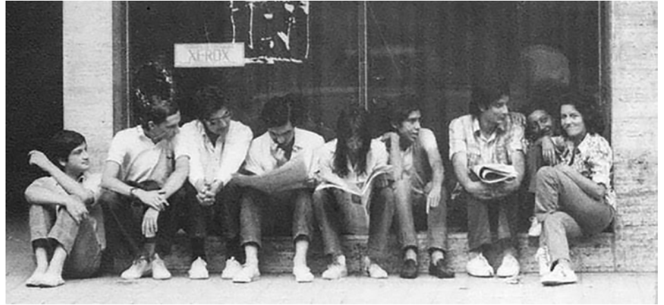
[Fig. 4] Students of the FAU of the National University of Cordoba, (Argentina), 1972.

Lessons between apprentices. Vertical structure in the teaching of architecture