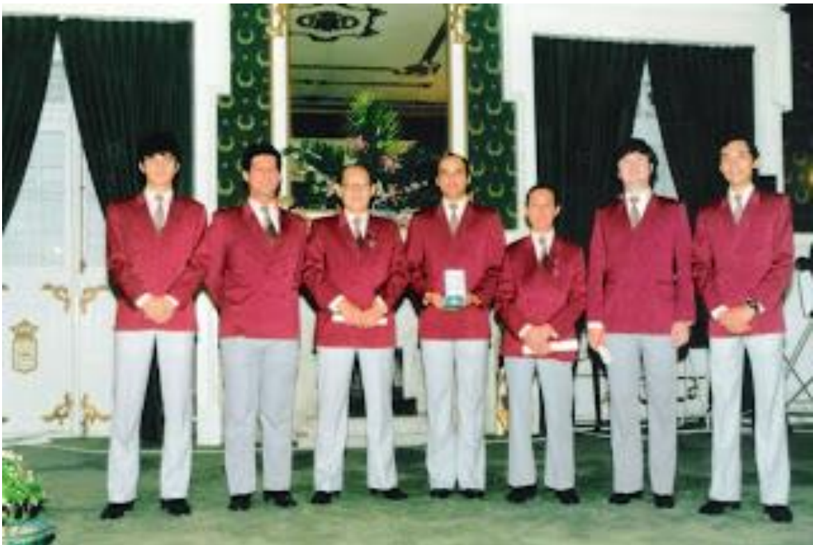
Figure 5: Tuna Macaense in 1983

In the 1970s to 1980s, the performing style of Tuna Macaense changed as some of the members turned old, some of them had passed away and some of them weren't interested in the music group anymore. Therefore, the members of the group had decreased although it was still running. According to Russo, Tuna Macaense has become an official association of the Macau government in 1982 and in the following year in 1983, Tuna Macaense was awarded "Medalha de Mérito Cultural" by the Macau Government. Russo hasn't joined the band at that time but only until 1989. In the following paragraph, I am going to talk about Tuna Macaense after Russo joined the band and become the leader.