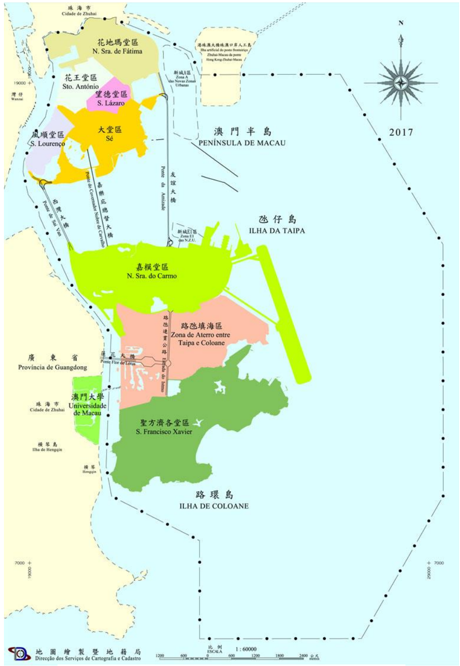
Figure 1: Map of Macau – 2017