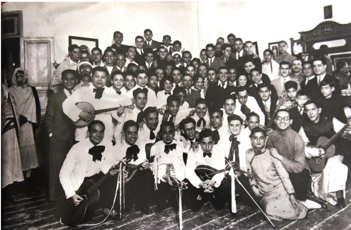
Figure 4: Tuna Macaense in 1935

“Tuna” is actually a musical group. There are many groups of Tuna in Portugal. There were also quite many groups of Tuna in Macau and “Tuna Macaense” was a bit more well-known. In 1935, there were about 30 members in a group of Tuna. At that time, a group of Tuna was formed at least by 30 members... There were people in Tuna Macaense who loved music a lot and they liked to bring partying atmosphere. In the 1930s, such as in a wedding party, they suddenly dropped in the house and gave a “flash mob”. They were not there to disturb but just wanted to be “Happy Together” and this was their aim at the beginning. That’s why they were really popular. Members were accumulated as time passed and maximum there were more than 30 members. You can see the photo from the album “Jardim Abençoado” which was exactly from 1935! However, Tuna Macaense had been functioning like this until the Segunda Guerra Mundial and it stopped. It was because of the war and no one tried to extend this performing form then this brought Tuna Macaense to a pause. Until people could think up Tuna Macaense and the Portuguese-Macanese music, it was already in the 1980s and Tuna Macaense started to be reorganized. (Santos, 13 th March, 2017, interview)