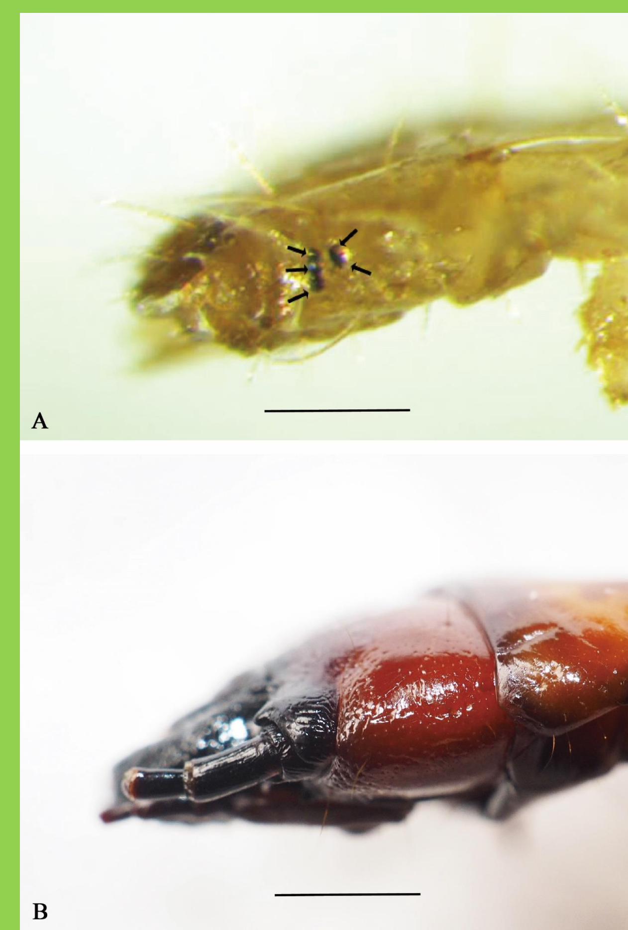
Figure 3. Head of Trictenotoma formosana Kriesche, 1919 larva in lateral view. A — first-instar larva. B — last-instar larva. Scale bar: A: 100 um; B: 3 mm.