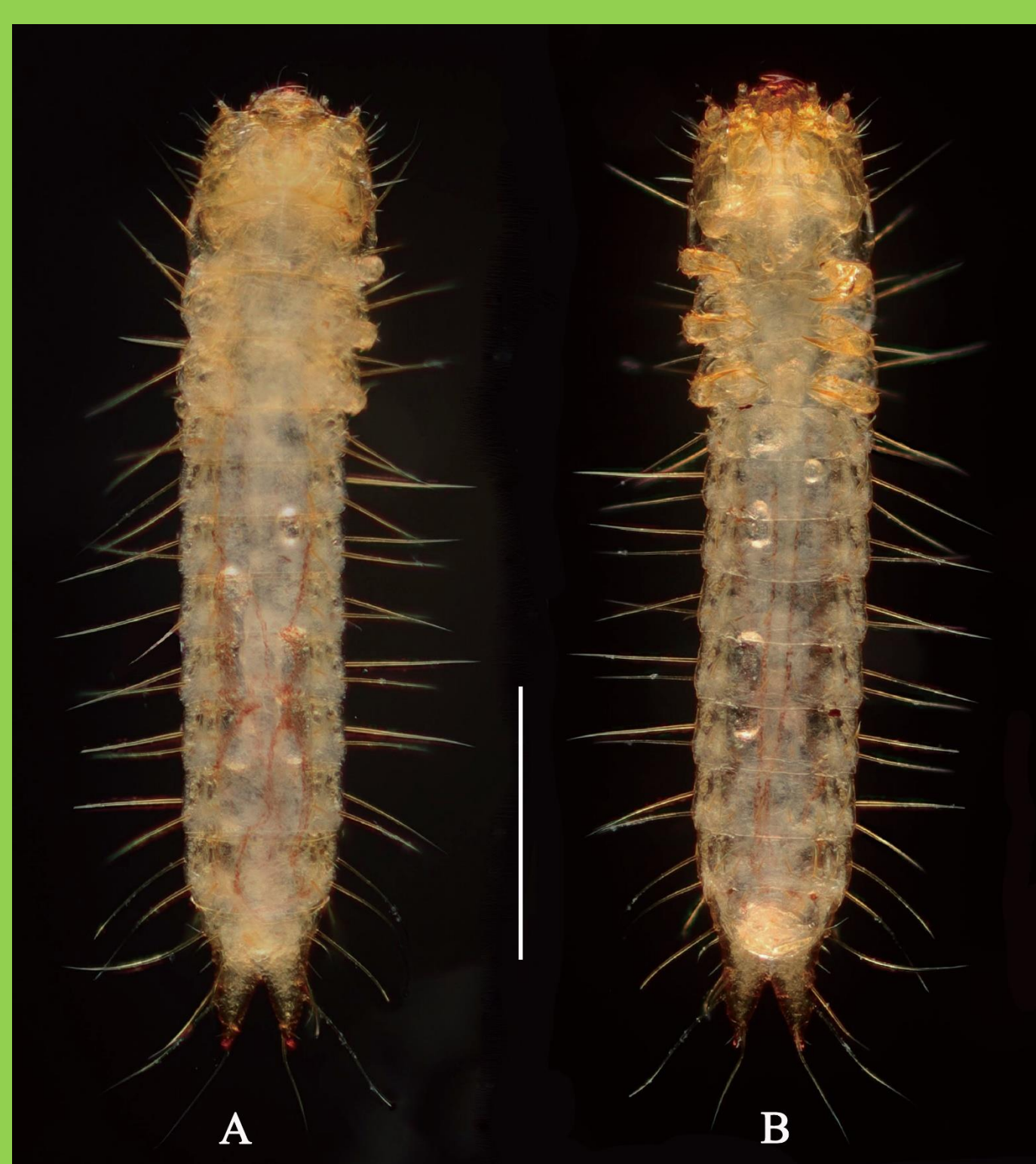
Figure 2. Habitus of first-instar larva of Trictenotoma formosana Kriesche, 1919. A — dorsal view, B — ventral view. Scale bar: 500 um.