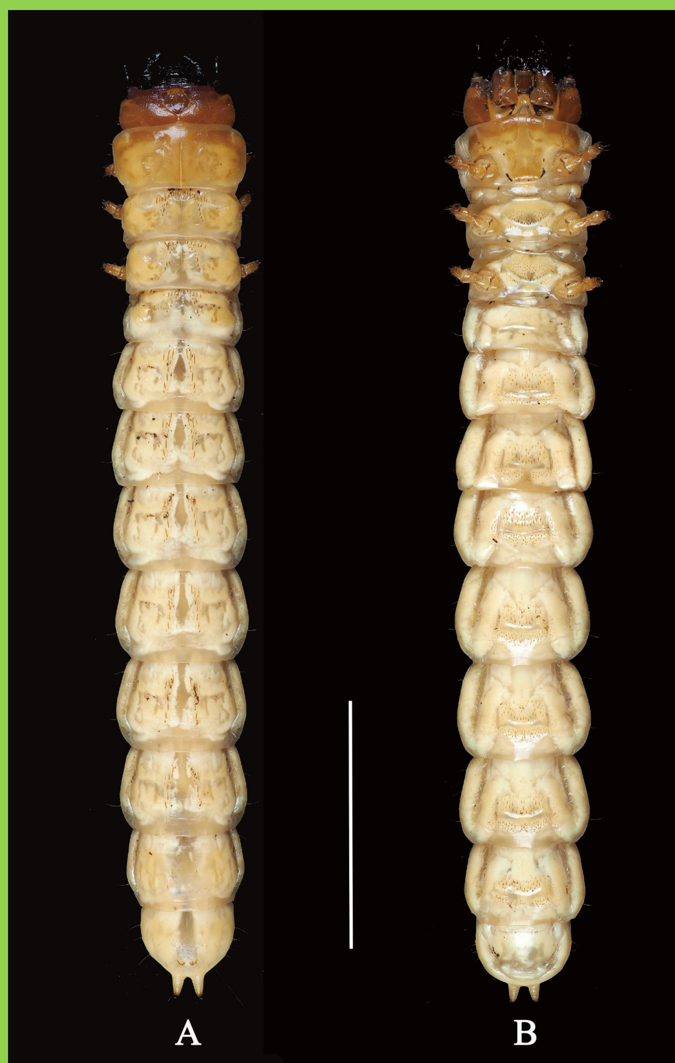
Figure 1. Habitus of last-instar larva of Trictenotoma formosana Kriesche, 1919. A — dorsal view, B — ventral view. Scale bar: 20 mm.