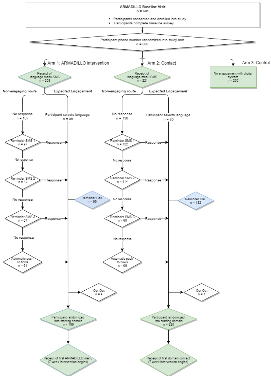
Figure 2. Progression of participants: how entry into the randomized controlled trial was planned (expected engagement) versus additional steps taken (nonengaging route) for each arm.