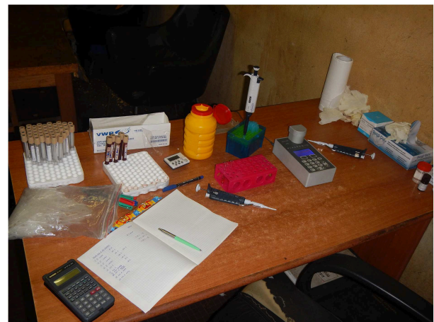
FIGURE 2 | Field set-up to perform the Fluorescence Polarization Assay (FPA) in a slaughterhouse in Abidjan, Côte d'Ivoire.

All serum samples were stored in Eppendorf tubes and kept at -20^{\circ}\text{C} until further testing. The serum samples were then thawed and tested for brucellosis using the RBT, ensuring a constant ambient temperature of 27^{\circ}\text{C} through air-conditioning of the laboratory where the test was performed. In cattle, a proportion of 30 \mu\text{l} of serum and 30 \mu\text{l} of antigen ( B. abortus strain S 99, Bio-Rad ND ) were mixed on a plate (17), while in sheep and goats the RBT was performed by mixing 75 \mu\text{l} of serum and 25 \mu\text{l} of antigen (18). The plate was rocked gently clockwise and