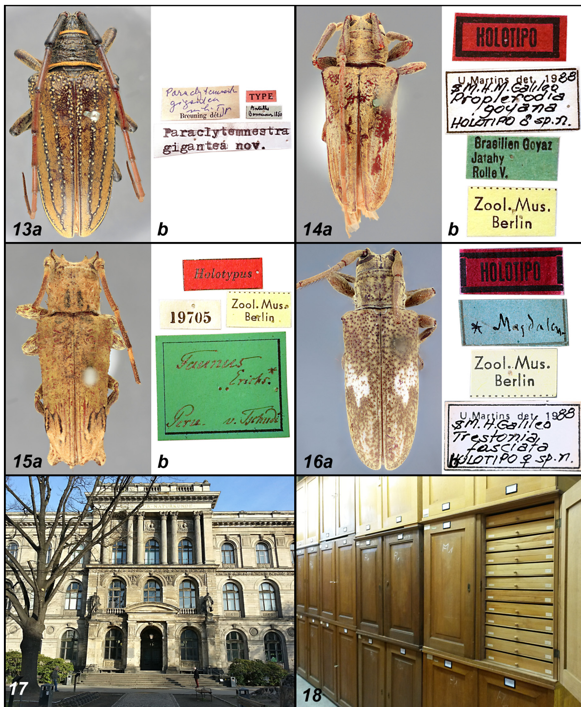
Figures 13–18. Four species of Onciderini and photographs of ZMHB collection. Fig. 13. Paraclytemnestra gigantea Breuning (a, dorsal habitus; b, labels). Fig. 14. Proplerodia goyana Martins and Galileo (a, dorsal habitus; b, labels). Fig. 15. Trachysomus faunus Erichson (a, dorsal habitus; b, labels). Fig. 16. Trestonia fasciata Martins and Galileo (a, dorsal habitus; b, labels). Fig. 17. Main entrance to ZMHB, March 2014. Fig. 18. Example of cabinet in Cerambycidae collection.