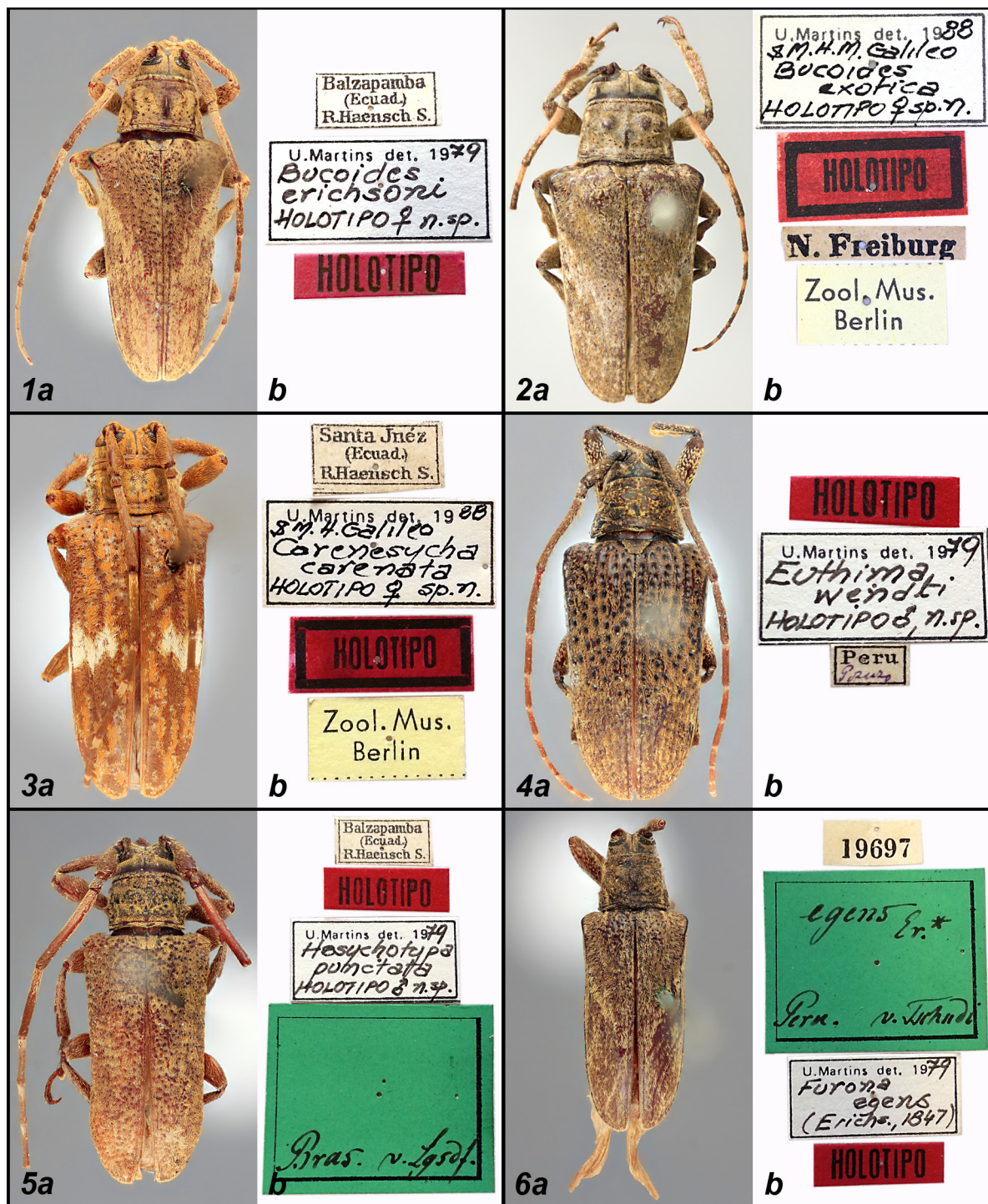
Figures 1–6. Six species of Onciderini. Fig. 1. Bucooides erichsoni Martins (a, dorsal habitus; b, labels). Fig. 2. Bucooides exotica Martins and Galileo (a, dorsal habitus; b, labels). Fig. 3. Carenesycha carenata Martins and Galileo (a, dorsal habitus; b, labels). Fig. 4. Euthima wendtae Martins (a, dorsal habitus; b, labels). Fig. 5. Hesychotypa punctata Martins (a, dorsal habitus; b, labels). Fig. 6. Hypselomus egens Erichson (a, dorsal habitus; b, labels).