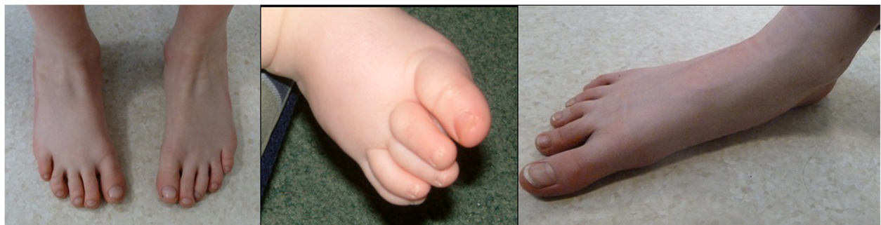
Fig. 3 Minor limb malformations Seen After VPA exposure. Note the hypoplastic and overlapping toes and flattening of the arches due to the joint laxity frequently seen in FVS

at 6 and 18 months [71]. Whilst further evidence is required, currently breastfeeding should be encouraged [72]. A thorough neonatal baby check [67] is essential after birth because of the higher risk of both major and minor malformations. Particular effort should be made to visualise the palate, to check for limb defects, most common involving the radial rays [42–46], to check the spine, and to note any dysmorphic facial features (Listed in Table 4) which are often very recognisable in the neonate. Pronounced ridging of the metopic suture with trigonocephaly [12, 76, 77] may indicate craniosynostosis which will require a referral to a craniofacial team. The risk for malformations of the genitourinary (GU) tract and the heart is increased. Though septal cardiac defects are more common, in some instances very complex congenital heart defects, which may be difficult to detect in neonates, may be present [94] and so one-off scans of the renal tract and the heart should be arranged after birth. Infants exposed to VPA have a significantly increased risk for neural tube defects, most of which will