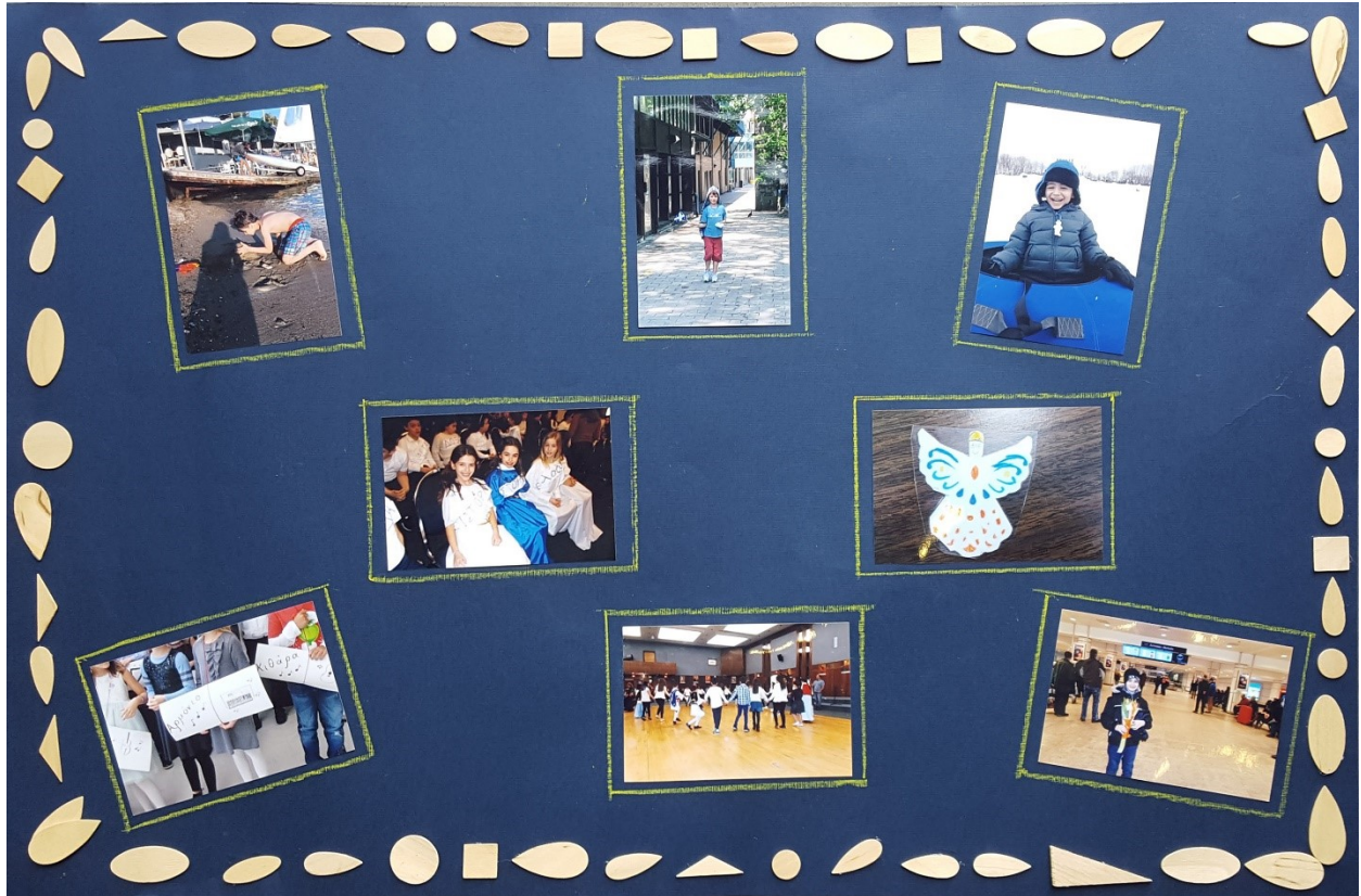
Figure 5. Home Away from Home: Openness, Destiny, Coming from Different Backgrounds montage made by a group participant that immigrated from Greece.