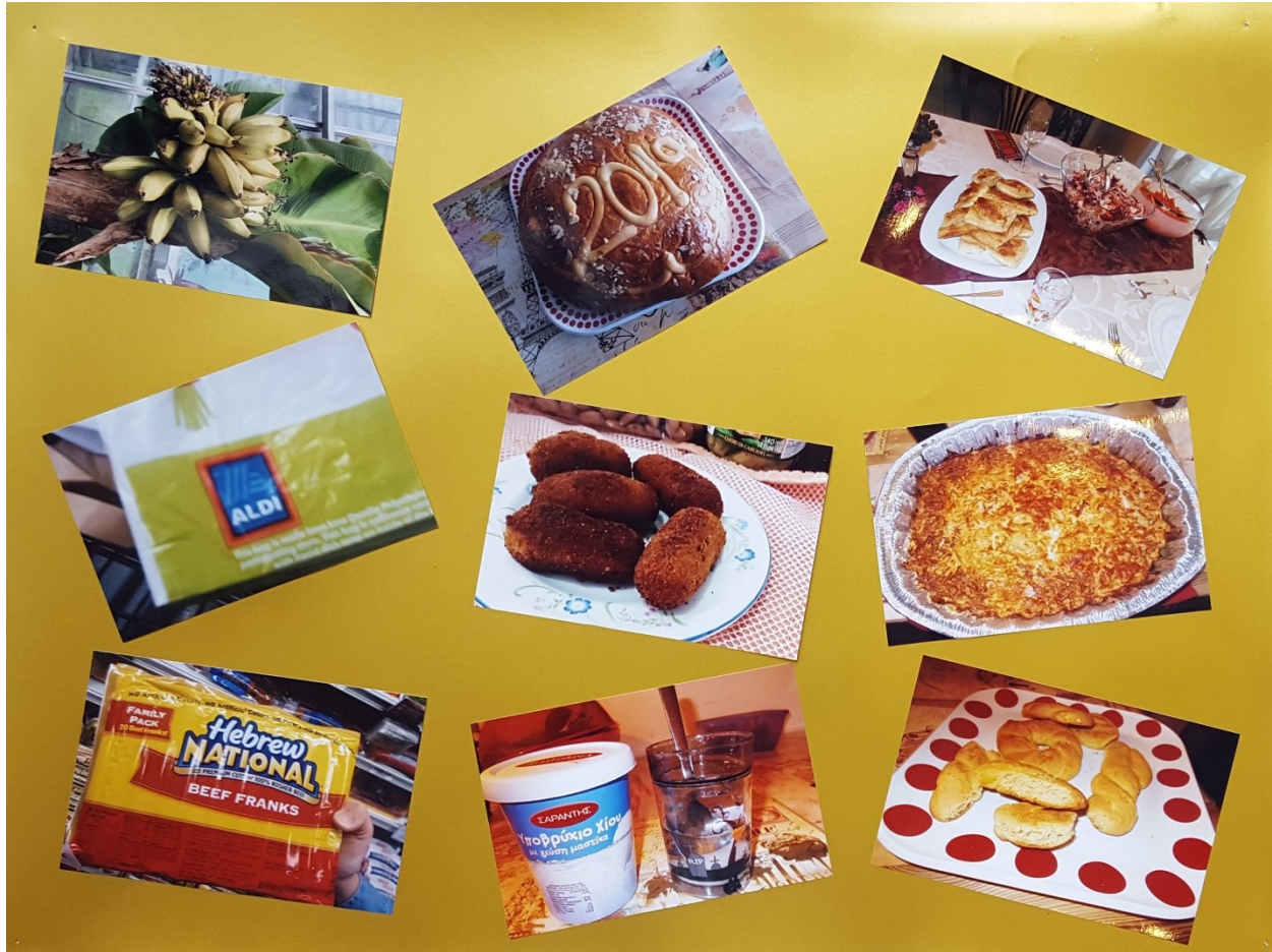
Figure 6. The photo montage, Food is an Element of our Life is a collectively identified theme presented in the final exposition. The top left photo is of bananas, a part of the everyday environment in other culture. The bottom left two photos represent a lack of accessibility to foods in Canada that are specific to other cultures. The bottom mid-photo represents a taste of home and a typical food that is characteristic of Greek culture. The rest of the photographs symbolize different shared foods and the relationship to cultural and social traditions for immigrants to the country they come from.