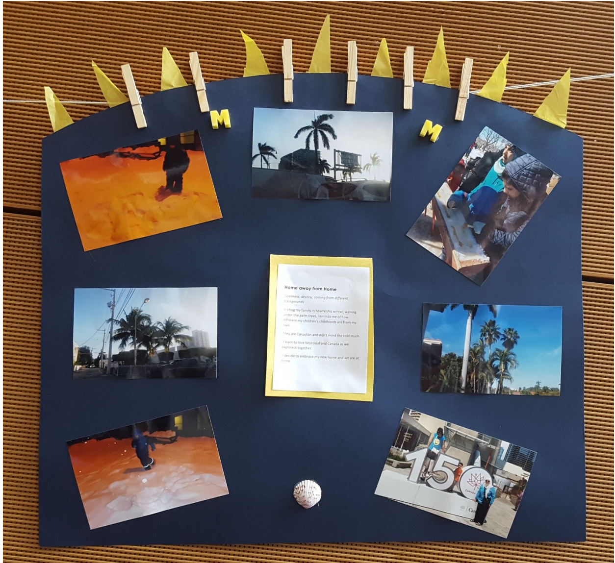
Figure 4. Home Away from Home: Openness, Destiny, Coming from Different Backgrounds photo collage from a mother that immigrated from the United States but was originally from Cuba.