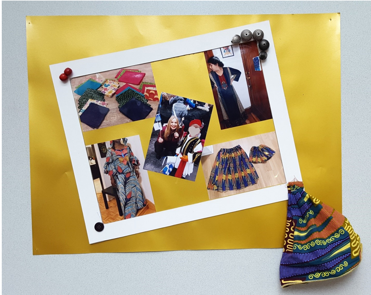
Figure 7. Clothing as a Symbol of Dual Identity and Acceptance Theme. The top left and bottom right photos depict the richness of colour and quality of fabric that may differ from Canadian and North American culture. The middle photo is of traditional dress in Greek culture. The top right is a photo of Algerian dress, while the bottom left is a photo of customary African dress.