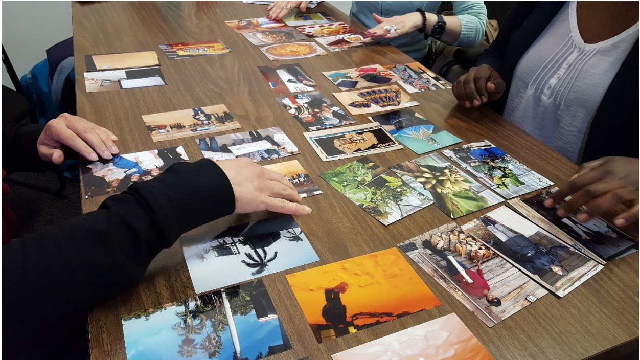
Figure 1. Participants grouping images together and identifying themes and issues.