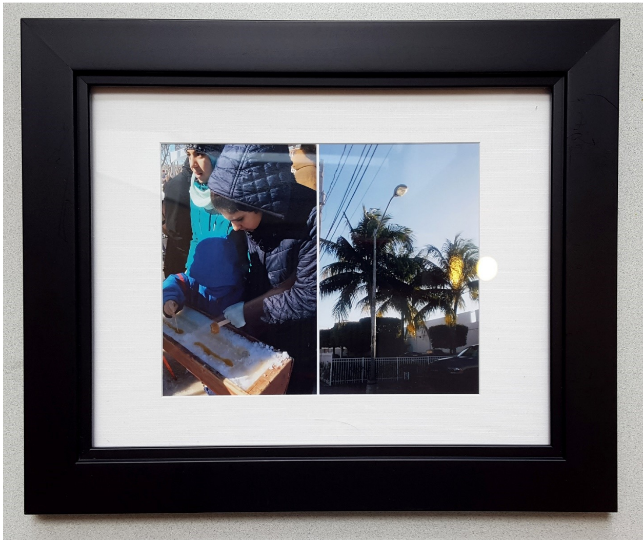
Figure 10. Enlargement of one mother's Home Away from Home Openness, Destiny, Coming from Different Backgrounds theme. The group depicted the dual climates from Canada and their cities of origin in their individual montages and collectively chose this one to represent symbolize having two cultural identities for the entire group.