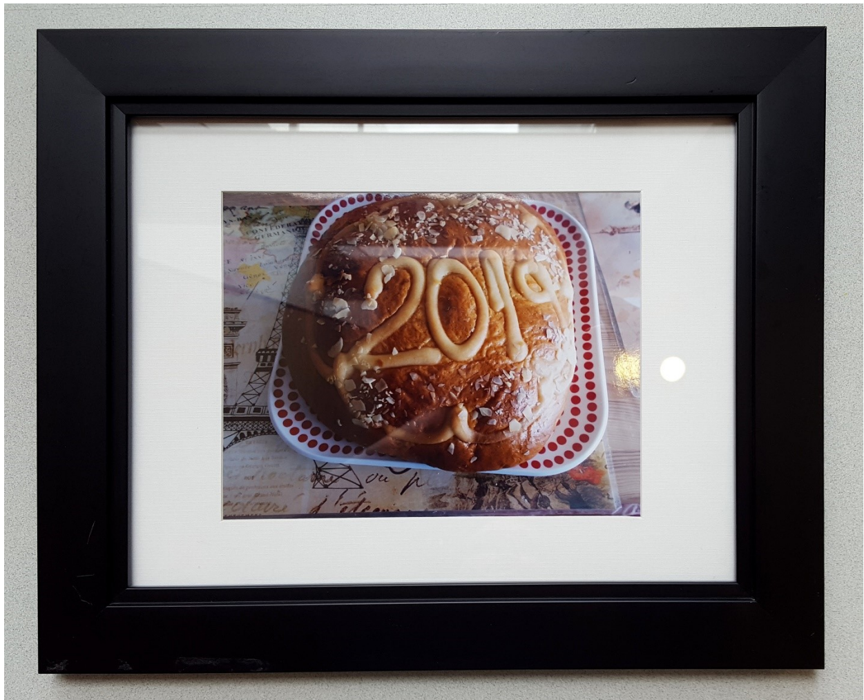
Figure 9. Enlargement of the bread that was part of the Food is an Element of our Life theme. This was a collective representation of the group experience participating in this project.