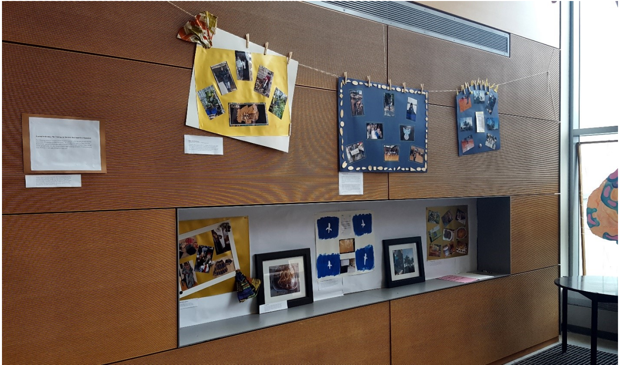
Figure 2. Photography displayed by theme in the exposition. The three Home away from Home: Openness, Destiny, Coming from Different Backgrounds individual montages are hanging at the top. The Food is an Element of our Life montage is on the bottom far right of the recessed section.