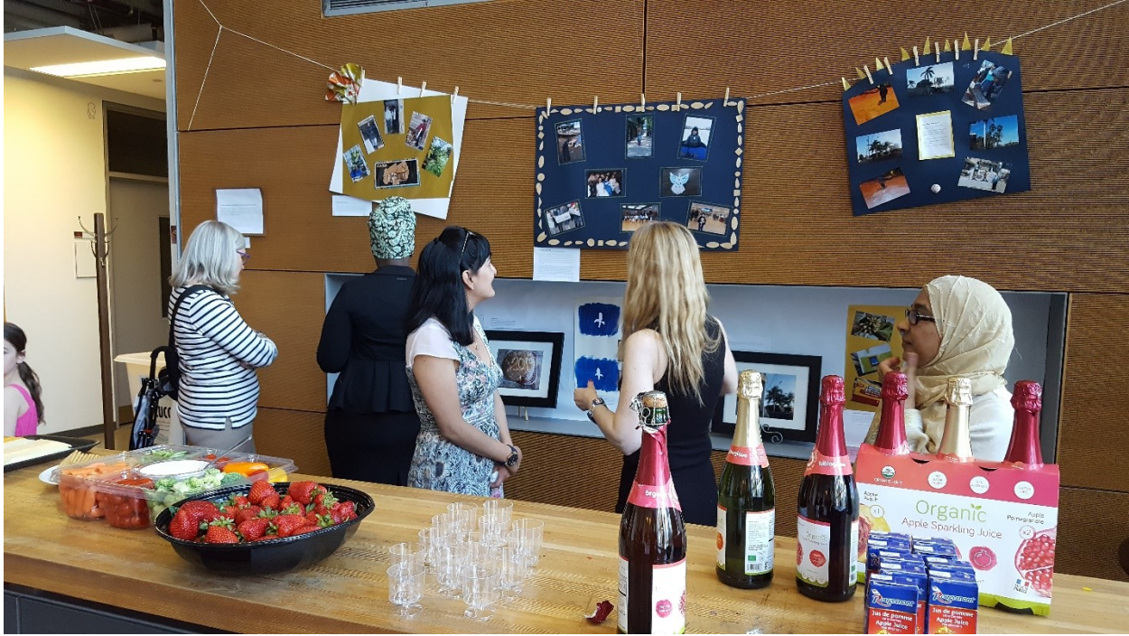
Figure 11. This is the PhotoVoice exhibition Opening. The artists (mothers) were present to answer questions and make comments for people that attended.