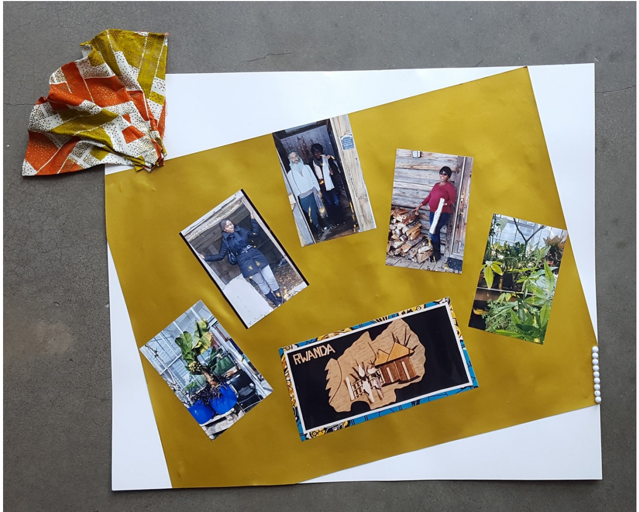
Figure 3. Home Away from Home: Openness, Destiny, Coming from Different Backgrounds photo collage made by a student mother that was displayed in the exposition.