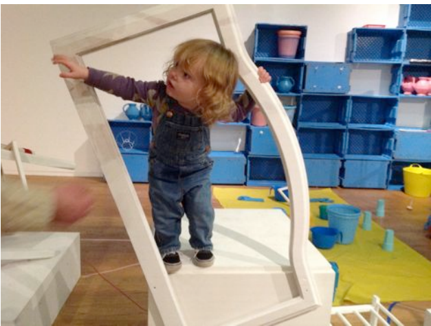
(Field notes, December 27<sup>th</sup> 2013 plus photographic documentation)