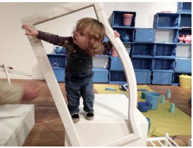
Pere Borrell del Caso, 1874