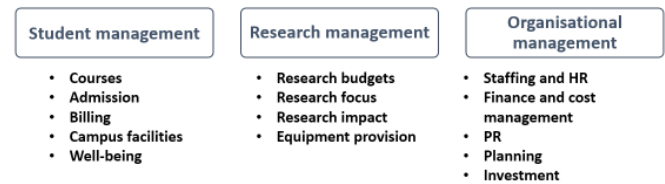
Fig. 2. LA can be considered from a managerial point of view in various aspects of an institution

terms of, for instance, directing recruitment, financing and investment.