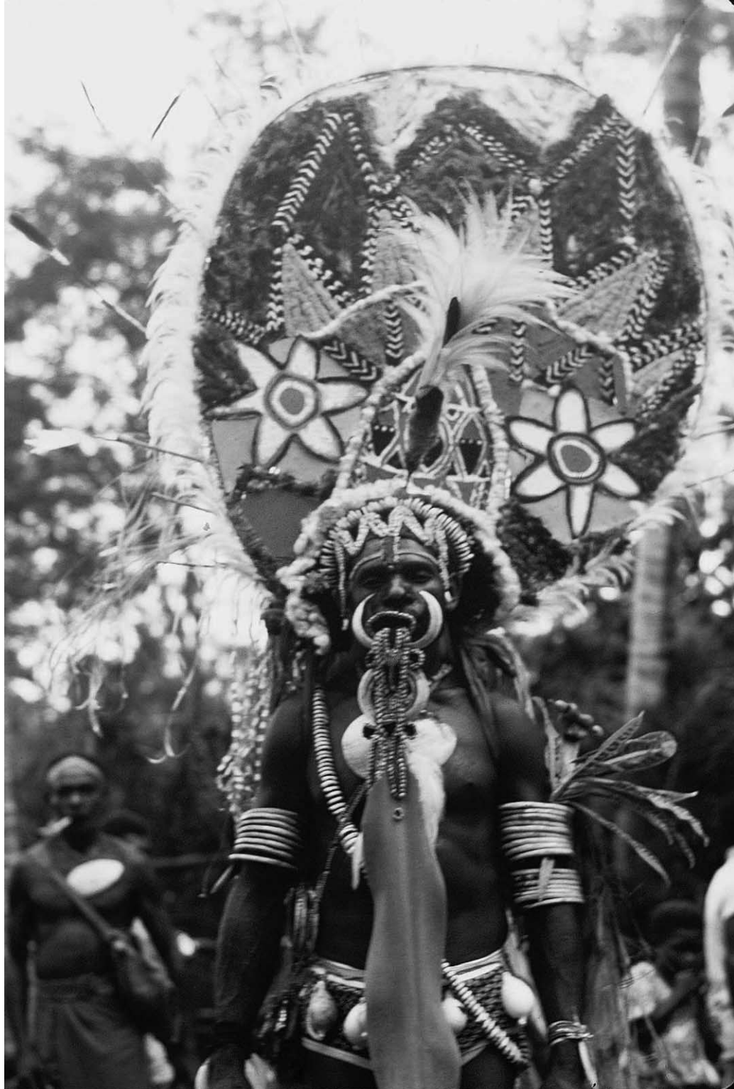
Figure 1. Abalam man in headdress, 1976, Apangai village. Color version available as an online enhancement.