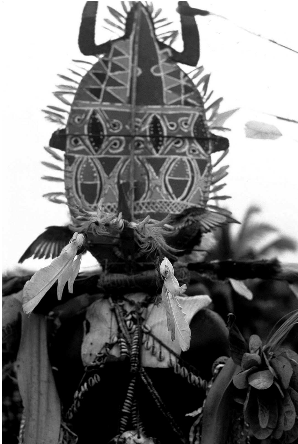
Figure 4. Abelam headdress with spiral motifs, 1976, unspecified location. Color version available as an online enhancement.