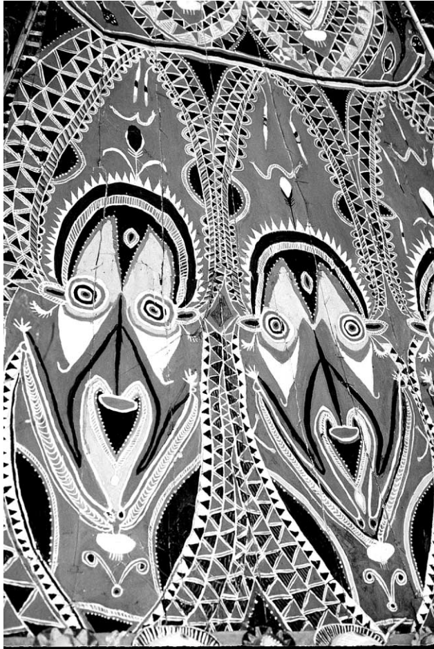
Figure 3. Two nggwalndu heads, façade of northern Abalam korombo , detail, 1976, Apangai village. Color version available as an online enhancement.

visual symbol, again invoking a sense of the world's underlying coherence (xviii). For example, the same white circle may be labeled both as an eye and a star, while a spiral shape is variously identified as “legs of pork,” “immature fern frond,” or “swirl in the water of a flooded river” (fig. 4; Forge 1970, 289). Furthermore, there exists a unity of the face painting style across media: wooden masks used during yam harvest ceremonies, carvings placed in the interior of the korombo , and initiators' painted faces. This unity is supposed to serve “one of the most important ‘theological’ functions of Abalam art” (280), communicating “the ultimate identity of man, long yam and spirit” (1966, 30). What this unity of style achieves is “effective communication . . . enhanced by the aesthetic effect” (1973b, 177).