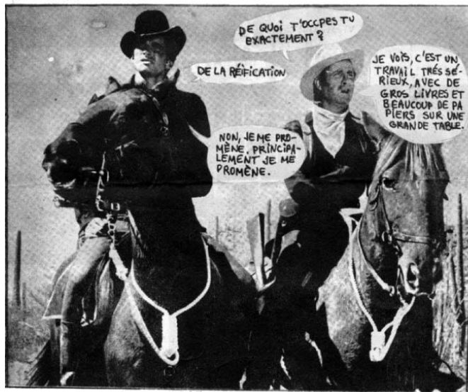
‘The Cowboy Philosopher’ 228

the Situationist use of détournement , was the cinema. ‘It is obviously in the realm of the cinema that détournement can attain its greatest effectiveness and, for those concerned with this aspect, its greatest beauty.’ 227 Debord would soon eschew any talk of aesthetics, at least in terms of the Situationist use of cinema; however, embedded here is the Situationist idea of the use of the arts for propaganda purposes. Cinema was both an appropriately fully industrial art form, one that was clearly and solely the product of industrial capitalist society, and the one most appropriate for détournement under present conditions. Cinema’s intimate relation to both industrial production and the sometimes large-scale creative collaborations that were required, made it the one artistic practice that clearly pointed toward the transformative potentialities of collaboration.