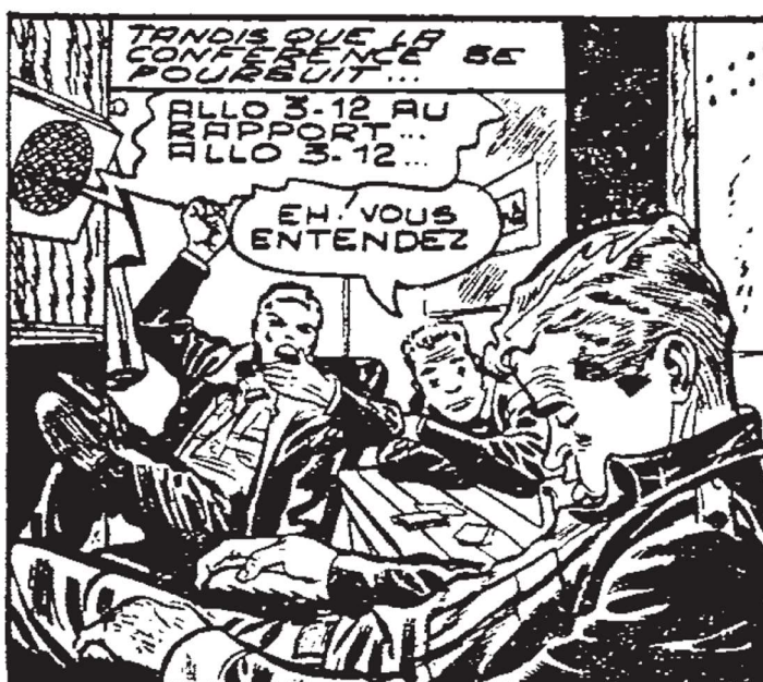
[At the Fourth conference of the SI...] “While the conference is happening.”

avant-garde artists’ in order to ‘themselves seize the weapons of conditioning’. 429 The majority of the conference rejected Prem and the Spur position. Kotányi pointed out the reality of increasing numbers of ‘wildcat’ strikes in France, Britain and even the US, further arguing that Prem’s parochial focus also underestimated the capacities of German workers. 430 The group referred to Prem’s conception as the reappearance of the ‘the hypothesis of the satisfied worker’, last seen presented by Constant and the Dutch section at the Third conference in April 1959. 431