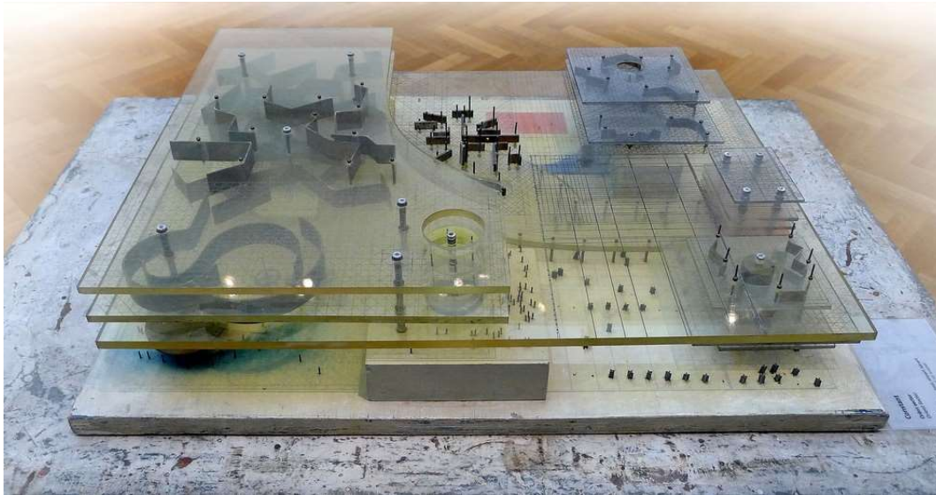
Photograph of the original model of the East sector of New Babylon

the Stedelijk Museum in Amsterdam, to be run by the Situationists. On the back of a successful showing of some of Constant's models of New Babylon (his imaginary unitary urbanist city) at the Stedelijk in May 1959, the curator Willem Sandberg agreed to host 'a large exhibition from the Situationist movement' in May and June of the following year. 335