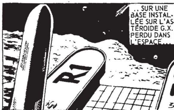
[The Fifth conference] ... on a base installed on asteroid G.X. lost in space... 460

those already in the SI'. 457 Of course the rest of the conference — which is to say the majority of the SI — rejected such a ridiculous demand. As the conference noted the proposal amounted to a call to 'exclude from the German section those opponents who supported within it the politics of the SI'. 458 Why Prem made this demand is less clear. Certainly, if such a proposal had been in place over the previous year the German section could have rejected both the move on the Central Council's part against Van de Loo and the push to make SPUR no. 5 reflect Situationist theses rather than just the artistic activity of Spur. In the conference notes the SI made the case for Prem's proposal being related to the ongoing divergence of the German section from the Situationist majority and their desire to maintain such de facto independence. i.e. that the German section minority position vis-à-vis the group remain in a majority position within the German section (for instance 'the hypothesis of the satisfied worker' associated with their belief in the domination of workers' by the bureaucratised trade unions and social-democratic parties). 459