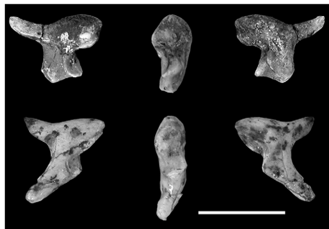
Fig. 3. The SK 848 ( Upper ) and SKW 18 ( Lower ) early hominin incudi in lateral ( Left ), anterior ( Center ), and medial ( Right ) views. (Scale bar: 5 mm.)

In contrast to the malleus and incus, stapes morphology is fairly similar across extant hominids ( SI Appendix, Fig. S3 ). Metric dimensions in all of the early hominin stapedes, including the size of the footplate, are relatively small compared with living humans ( SI Appendix, Table S6 ). The footplate area in SKW 18