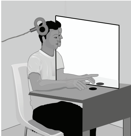
FIGURE 1: Schematic representation of the mirror visual feedback condition during motor task.

All subjects performed the experiments in the same order as they are listed above: DVF, MVF, and BVF.