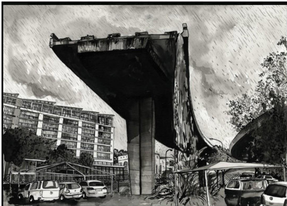
Figure 1. The Unfinished Bridge , Lucie Demoyencourt, 2016

in and out of the city centre. This was mostly completed, and is now the Nelson Mandela Boulevard that now connects the city with the more affluent southern suburbs, passing through Woodstock and the site of District 6, the location of one of the most infamous forced removals of the apartheid era. 111 However, due to budget constraints, the bridge itself has stood in its unfinished state since 1977. Its unused surface, and also the shady spaces beneath its supports, are classic pieces of fragmented, accidental urban wasteland: left to moulder, as on either side busy traffic lanes connect the CBD to the popular Waterfront, Convention Centre, and trendy Sea Point, and on the other to the affluent southern suburbs, the N1 Highway, and the rest of the country.