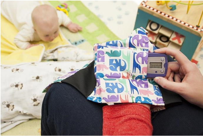
LENA device is inserted into the vest pocket.