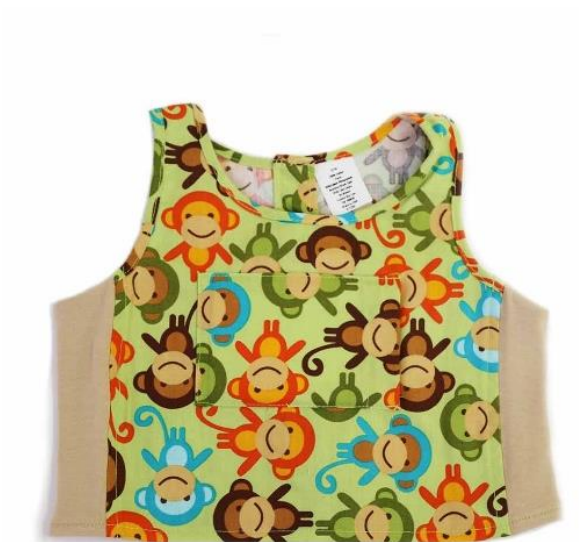
Vest is worn on recording days.