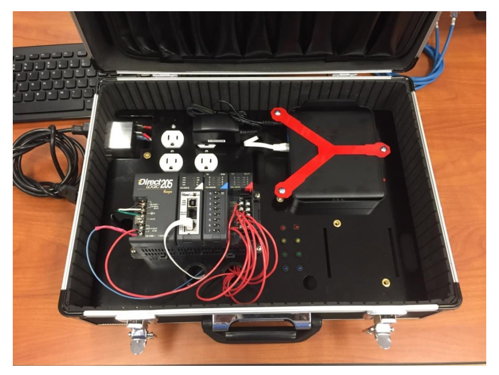
Figure 1. The Industrial Control Systems Toolkit

Programmable Logic Controller (PLC) programming, control system networks and protocols, control system vulnerability assessment and penetration testing, and defensive techniques and incident response for control systems. Furthermore, for each module, we provided hands-on laboratory projects that introduced the Problem Based Learning (Hung, Jonassen, & Liu, 2008) approach to learning and enabled the participants to practice the technique before applying it in their classrooms. These laboratory exercises were conducted using a control system toolkit, shown in Figure 1, which was designed guided by the fundamental concepts of simplicity, modularity, and portability. Every participant gets to take a toolkit back to his/her home institution. Technology support and a follow-up meeting are provided and scheduled during the school year. The coaching and follow-up process ensures that the instructors are likely to keep the strategy, skill, or concept and make it part of the classroom repertoire (Joyce & Showers, 2002). The initial curriculum modules, which will be enhanced and expanded in subsequent years, are shown in Table 1. A subset of the accompanying laboratory projects is enumerated in Table 2.