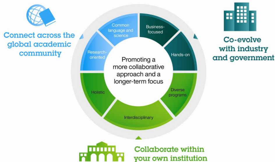
Figure 2: Cybersecurity Education for the Next Generation: Emerging Best Practices. Adapted from: Marisa Vireos, available at https://www.nist.gov/sites/default/files/documents/2017/01/19/d1_trk3_viveros_cybersecurity_education_next_generation.pdf

A multidisciplinary school-wide educational strategy for cybersecurity would involve a situation where a school can identify and recruit students who would be trained in the cybersecurity field, both technical and nontechnical students can be steered to study cybersecurity, needed resources are sought to bolster a robust cybersecurity academic community, and collaborative partnerships are formed with organizations. It is more adept for an educational institution to address these issues from a top-driven, multidisciplinary approach than with a haphazard approach by individual departments within the institution.