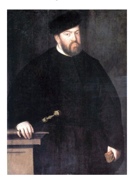
Figure 12 (a)