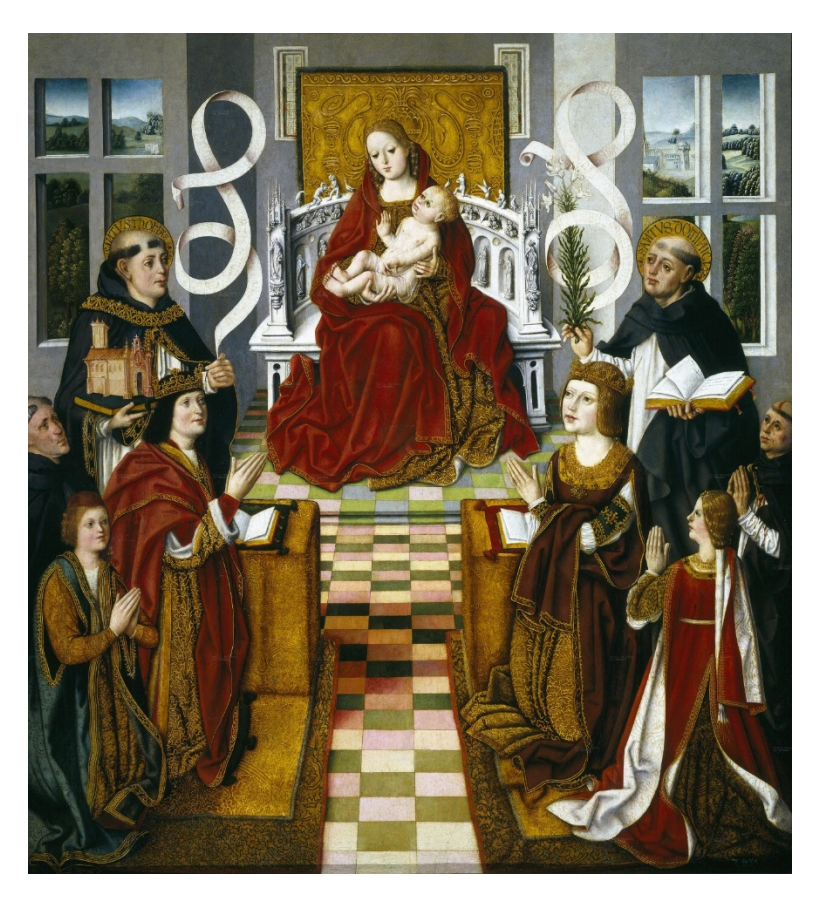
Figure 5: Attributed to Jorge Afonso (School of Lisbon), Virgin of the Portuguese Monarchs , mixed media on panel (123 x 112 cm), ca. 1490, Madrid, Museo del Prado

In 1490, when the Prado Virgin of the Monarchs was painted, a wedding was celebrated between the dynastic houses of Portugal and Spain (Cordeiro de Sousa, 1954; Sanceau, 1959, pp. 323-332; Oliviera Marques, 1971, pp. 31-35). The only son of João II and Leonor—a 15-year-old Prince Afonso—married the 20-year-old eldest daughter of the Spanish sovereigns Isabel and Ferdinand. Princess Isabella of Asturias, is seen de dos , that is, from the back, and her face is in profile.