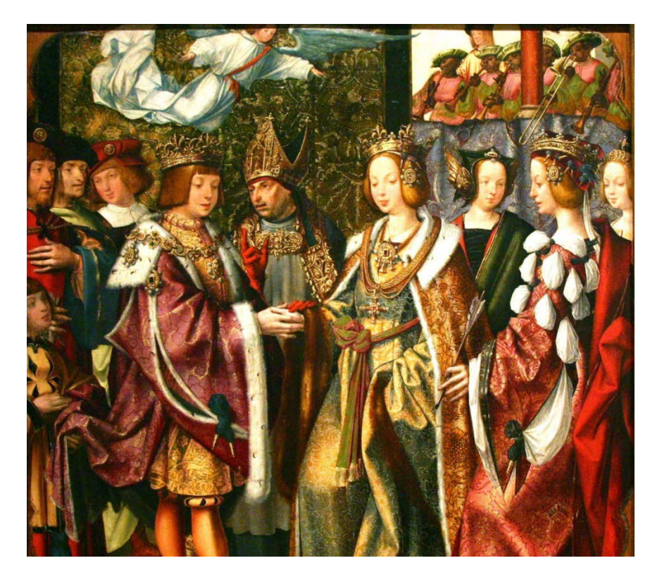
Figure 8: Attributed to Jorge Afonso and Gregório Lopes (School of Lisbon), (a): The Meeting of St. Ursula and Prince Etherius - reverse side of The Departure of St. Auta's Relics from Cologne

Under Manuel I, the technological skills of the Portuguese explorers quite simply changed the medieval world picture. A decade after a trajectory by sea to East Asia was achieved by Bartholomeu Dias's voyage round the Cape of Good Hope, Vasco da Gama achieved a route to India, arriving in 1498 at Calicut on the southern Malabar Coast. Then in 1500 Pedro Álvares Cabral on his way to India, encountered the magnificent land of Brazil, vastly abundant in natural resources. Portugal continued to excel in the building of ships, improving designs for strong winds and ever changing currents. The first large cargo ships of the early 1400s were the double and triple-masted caravels. With their lateen triangular sails, they accommodated as much as 200 tons of goods and were extremely agile in the waters. By the 16th century, however, the caravel was superseded by the even larger carracks, which had two decks, three to four masts, overlapping square sails and a storage capacity of 2000 tons. Manueline Lisbon, therefore, was a bustling city for trade, with carracks returning from many African, Indian, and Brazilian ports