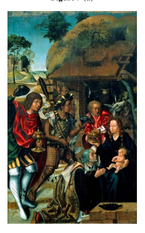
Figure 9 (a)