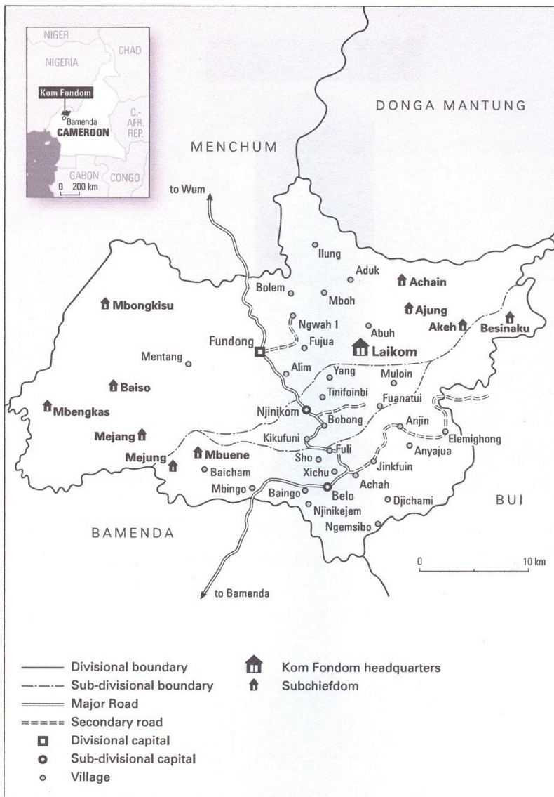
Figure 2: Kom Fendom showing its villages and sub-chiefdoms