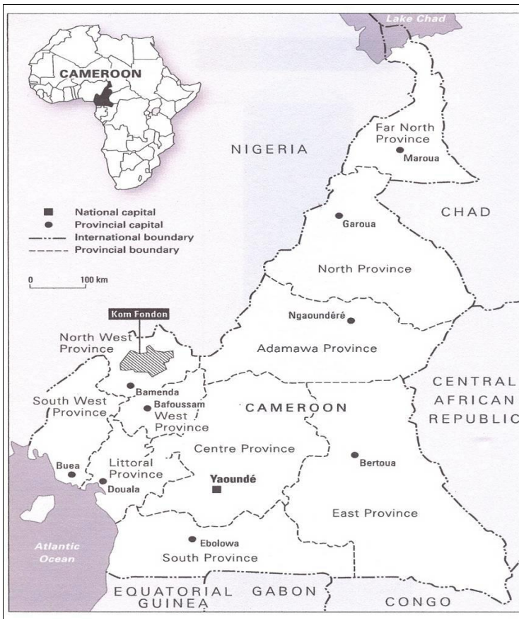
Figure 1: The position of Kom in the Bamenda Grassfields of Cameroon

Source: Aaron S. Neba, 1987, Modern Geography of the Republic of Cameroon (2 nd ed., p. 15). Bamenda, Cameroon: Neba Publishers.