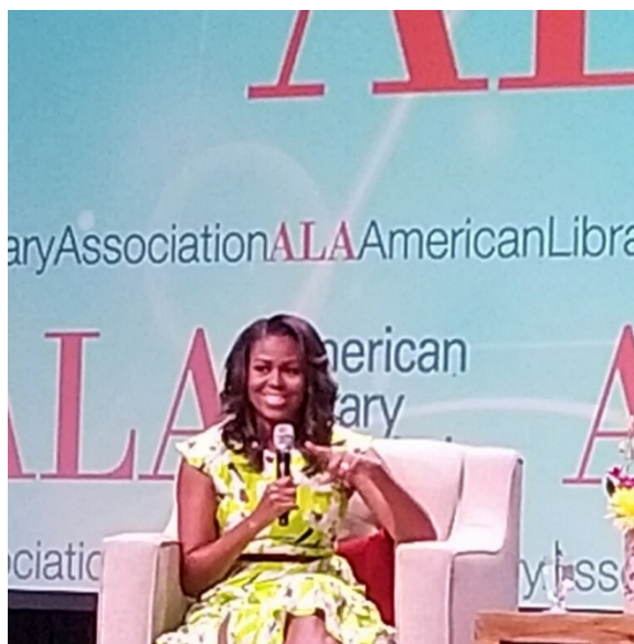
Michelle Obama

all of the “swag” available to attendees. Anything Harry Potter items from Scholastic were “hot tickets,” but my favorite was a Springer t-shirt that says, “My secret power is librarianship. What’s yours?”