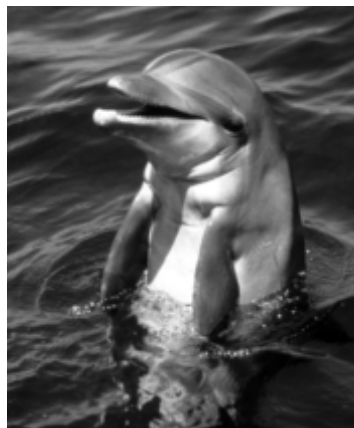
Making an error on porpoise can be educational.

I don't know how long this error continued, but in what must count as an early experience with epiphany I realized at some point that the subtitle of the magazine was not "Fun with a Porpoise," but