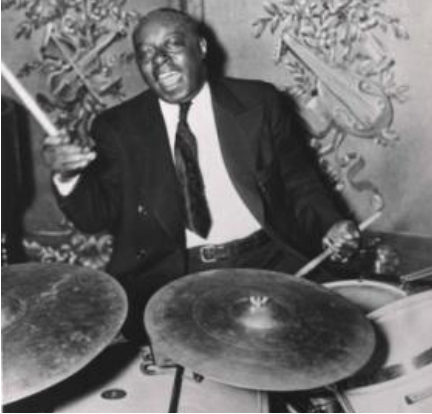
Warren "Baby" Dodds

For my recital, I have decided to pay tribute to my jazz heroes throughout the timeline of jazz history.