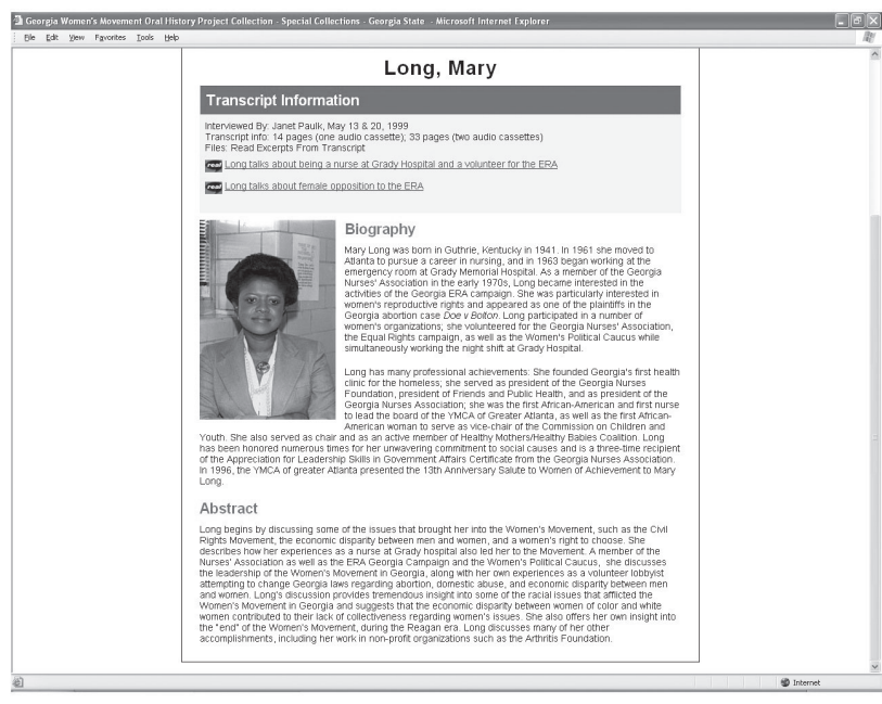
Fig. 4 (below): Excerpts of both interview transcripts and sound recordings are available on the Web site of the Georgia Women's Movement Oral History Project.