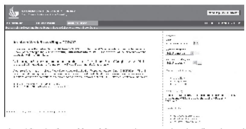
Fig. 1 (above): The Weblog of the Georgia State University Library's Special Collections Department.