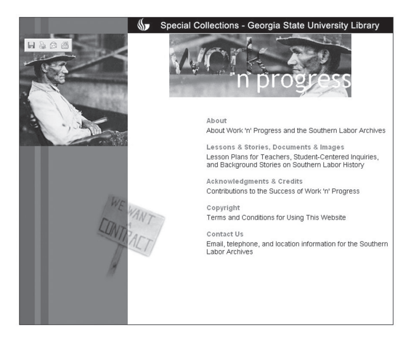
Fig. 6 (below): "Work 'n' Progress" was designed for use by social studies teachers. (Screenshot from <www.library.gsu.edu/spcoll/labor/wnp>)

Fig. 5 (above): Full-text, searchable content of labor publications is available at the GSU Library's Web site of the International Association of Machinists and Aerospace Workers Collection. (Screenshot from <a href="http://dlib.gsu.edu/spcoll/iam/list.asp">http://dlib.gsu.edu/spcoll/iam/list.asp</a>)