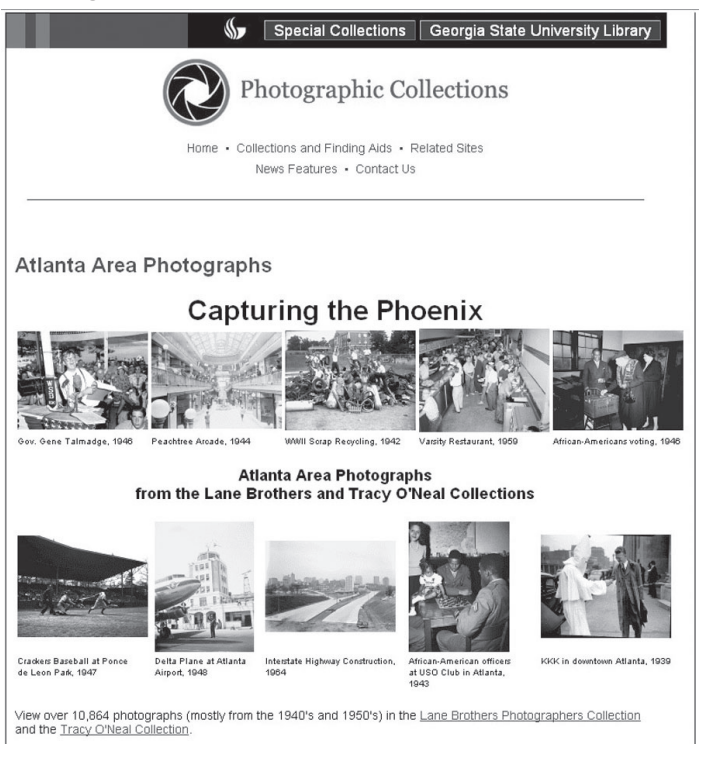
Fig. 2 (below): Capturing the Phoenix: photographs from several image collections. (Screenshot from <www.library.gsu.edu/spcoll/pages/pages.asp?ldI D=105&guideID=552&ID=3961>)