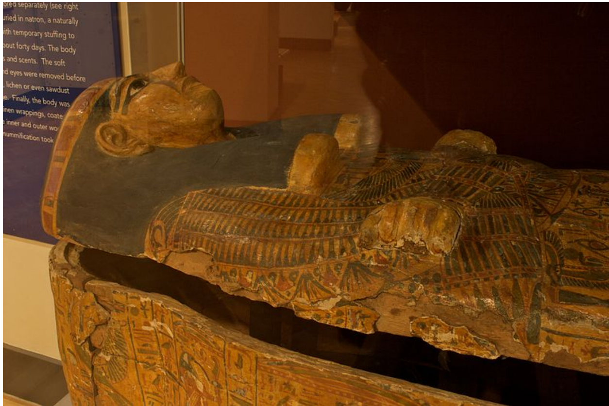
Fig. 4. Female Burial Sarcophagus.

Fundamentally, this recurring theme of a womblike transformation in death refers back to the Egyptian idea of spiritual androgyny. In order for Egyptian spiritual order to be preserved, each soul must marry their two ambiguous genders inside of the empty feminine space of the coffin, and make a complete sexual transition into the afterlife. By taking on the role of multiple genders and giving life to both male and female characteristics within the same soul, the ancient