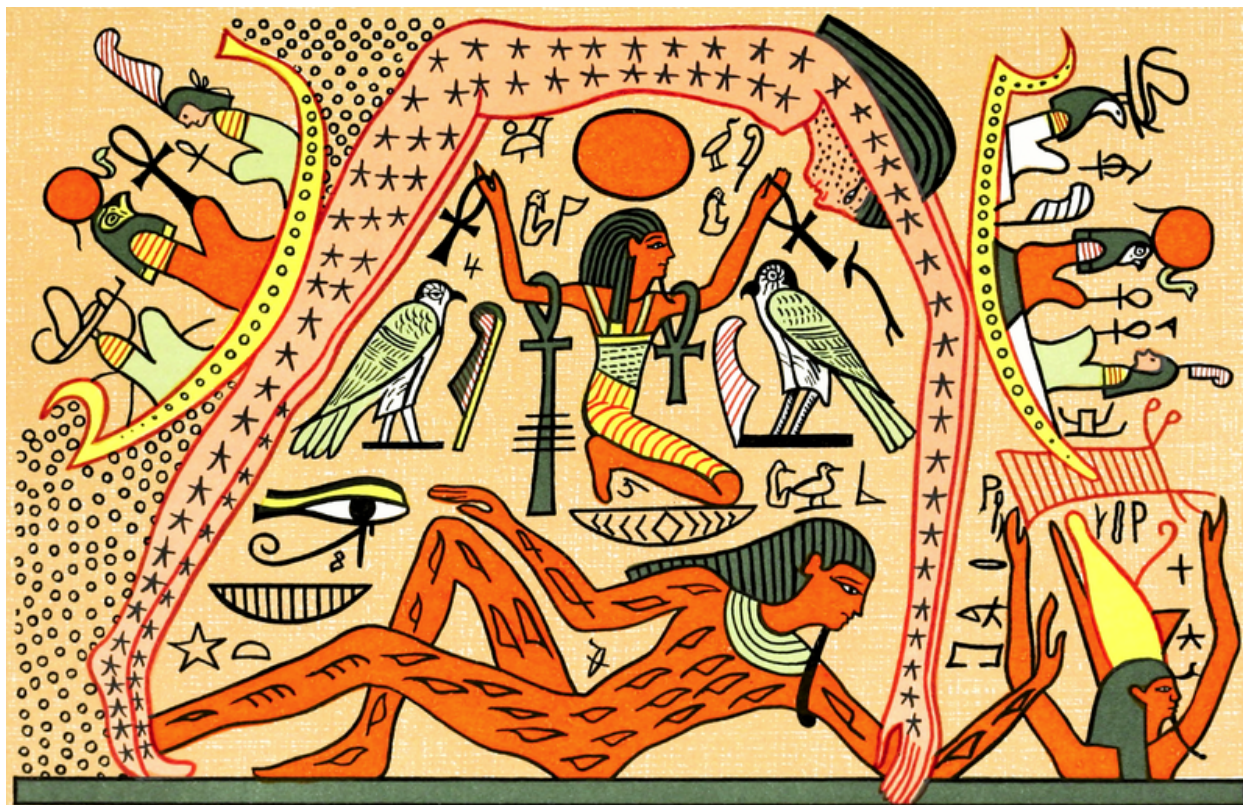
Fig. 2. Nut arching over Geb.

Earth, who as a result translates the message into masculine action. This sexual conversation between the astrological and physical aspects of Egypt reflects the mythological story of the sky goddess Nut and her consort, Geb; the two were passionately inseparably, and by the forced division of their lustful bodies the earth and sky were created 16