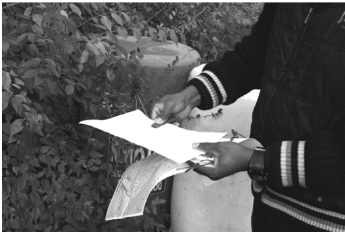
Figure 5: Students use a custom topographic map of the course area and a control card with directions for following the course. When arriving at a control checkpoint on the course, they are asked to use the needle punches with their control card. Since each needle punch has its own unique pattern, the instructors are able to track if a student arrives at the correct checkpoint.