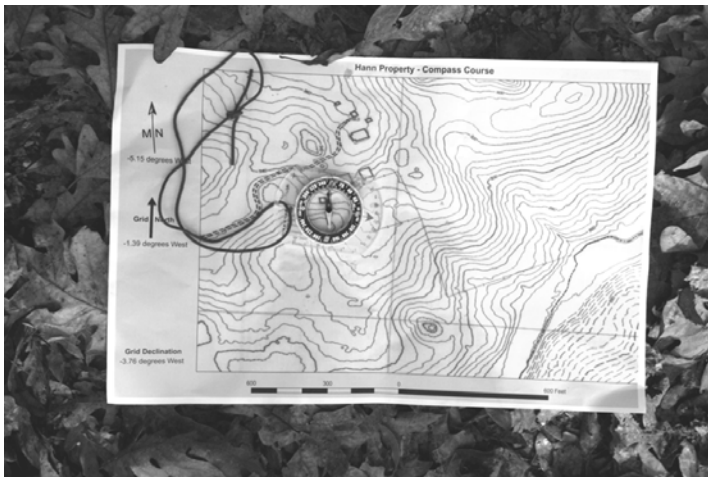
Figure 3: Map oriented correctly with the compass needle parallel with the Grid North arrow on map.

Ensuring that the map and compass are oriented properly is the most important lesson of the orienteering workshop. Now the group is ready to begin the outdoor