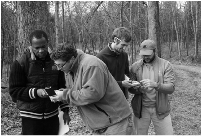
Figure 1: Instructors teaching participants how to adjust their compasses for magnetic declination.

Once the compass is adjusted for magnetic declination, the easiest way to orient a map is to place the compass on top of the map. Students learn to turn the map until the compass needle is aligned (parallel) with the