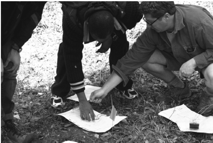
Figure 2: Learning to orient a topographic map with a compass.

north/south neat line on the map (Figures 2 and 3). They become aware that red = north and white = south. Students learn that this is an easy way to accurately orient the map with the compass.