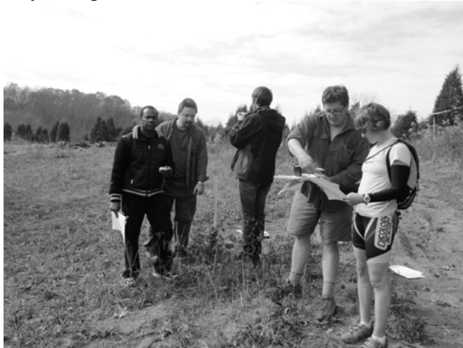
Figure 4: A group begins the orienteering course with help from the Map/GIS Librarian.

course. The participants work as one group (Figure 4), and the instructors help with questions about how to navigate the course.