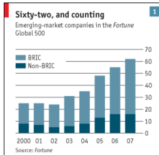
Figure 2: Rise of BRIC Country Multinationals