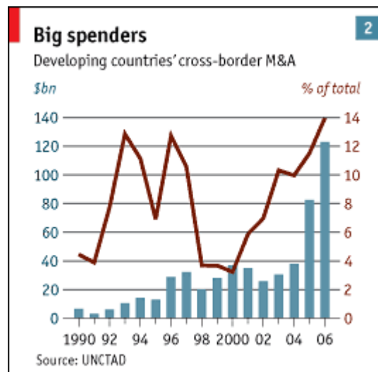
Figure 3: M&A's of Emerging Country Multinationals