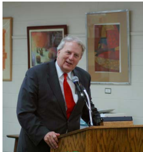
Former Governor Roy Barnes defines true leadership as that which “comes out of crisis” while accepting the 2007 Public Citizen of the Year Award.