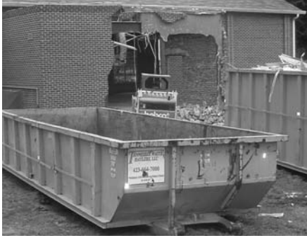
The demolition of the library begins with a small hole. The children attending storytime were allowed to watch the construction workers making the hole in the library building from a window in our temporary location, just next door in the Chickamauga Civic Center. One small boy said, "This is the best thing I have ever seen at the library!"

Chickamauga Public Library collection was re-housed in the Chickamauga Civic Center, located just behind our library building. Most of the collection was moved the first two weeks in June, and the library staff is most happy with the temporary location of the collection.