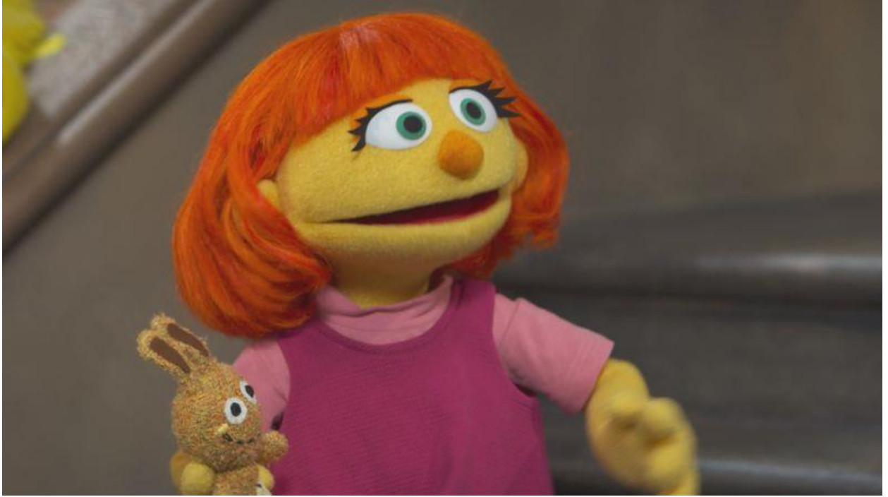
Fig. 24. Sesame Street to introduce Julia in April. https://www.latimes.com/entertainment/tv/la-et-st-sesame-street-muppet-autism-20170319-story.html (accessed April 9, 2019)