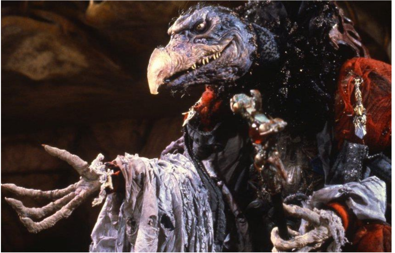
Fig. 8. skekSil the Chamberlain . http://www.darkcrystal.com/galleries_skeksis.php (accessed on March 5, 2019). © The Jim Henson Company