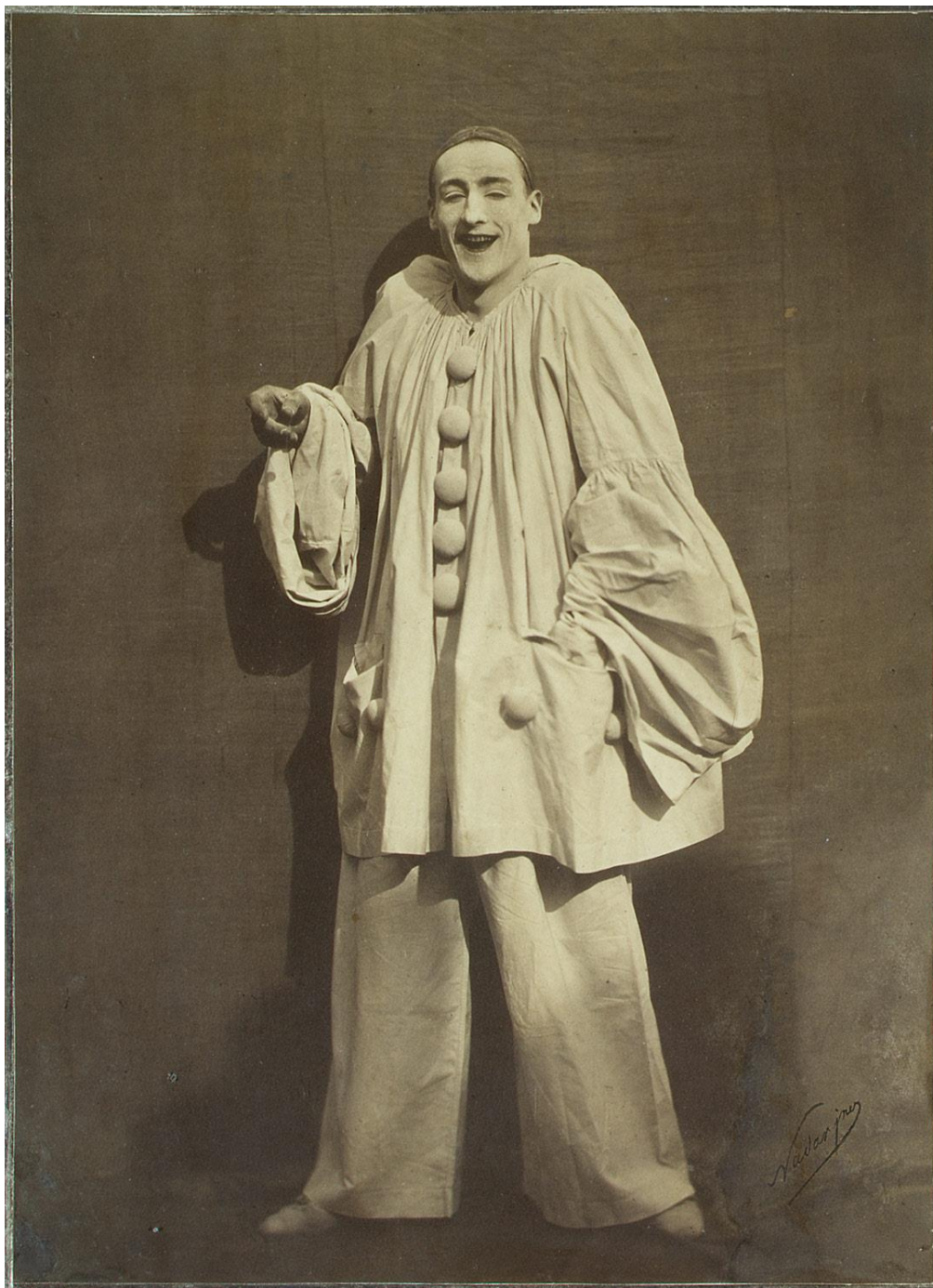
Fig. 3. Adrien Tournachon, Pierrot Laughing , 1855. The Metropolitan Museum of Art. https://www.metmuseum.org/toah/works-of-art/1998.57/ (accessed on April 10, 2019).