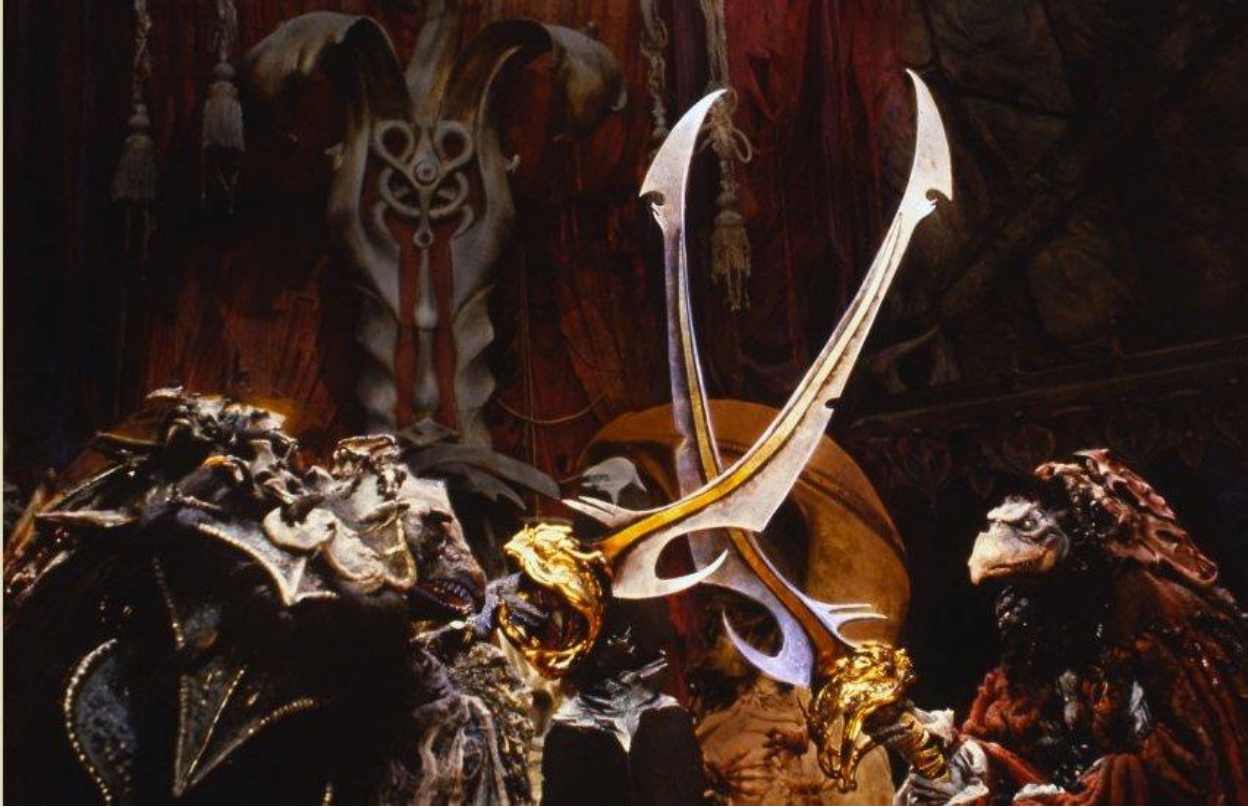
Fig. 16. skekUng the Garthim Master and skekSil the Chamberlain engage in a Trial by Stone.