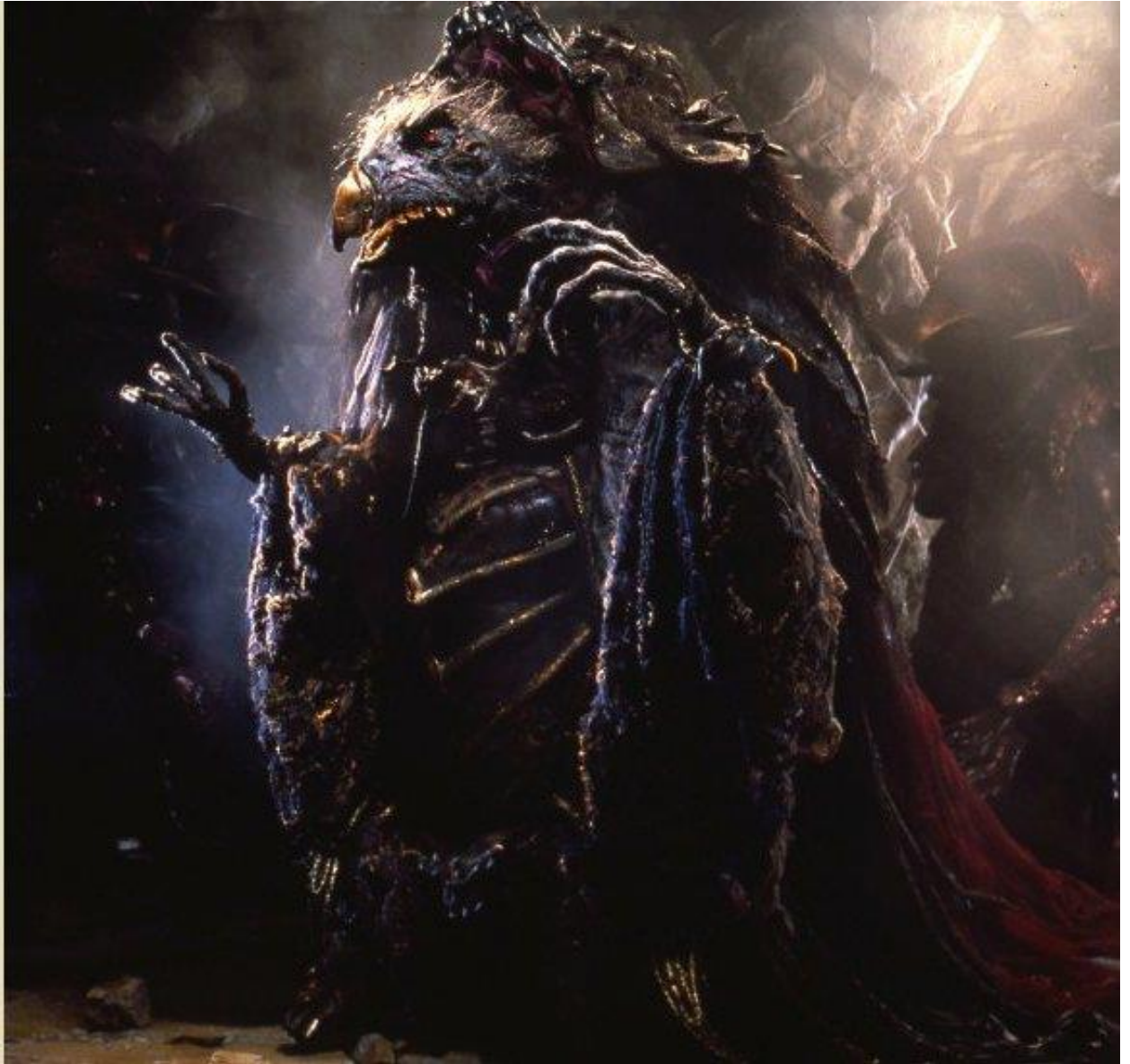
Fig. 15. skekUng the Garthim Master . http://www.darkcrystal.com/galleries_skeksis.php (accessed on March 5, 2019) © The Jim Henson Company