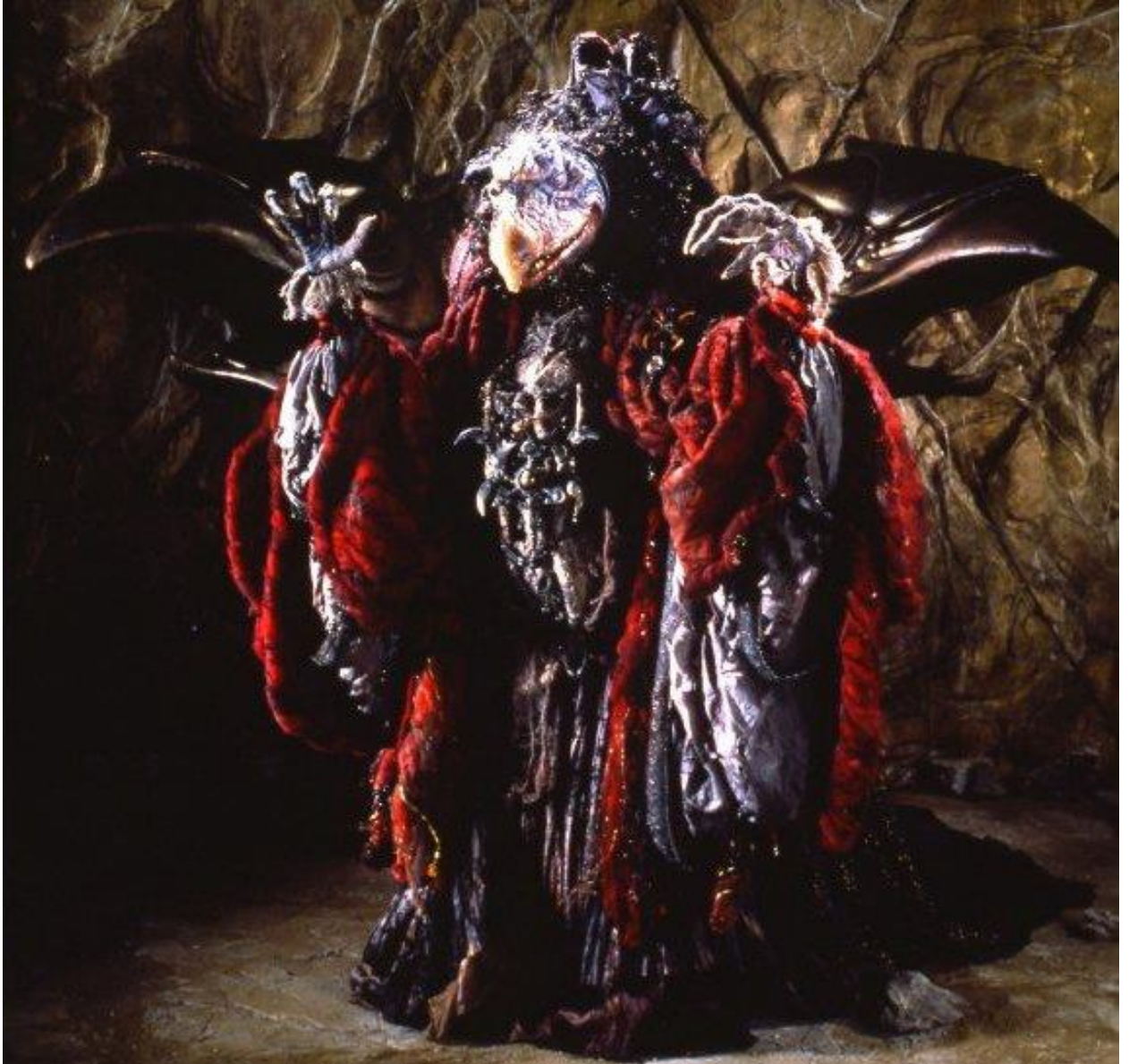
Fig. 14. skekSil the Chamberlain . http://www.darkcrystal.com/galleries_skeksis.php (accessed on March 5, 2019) © The Jim Henson Company