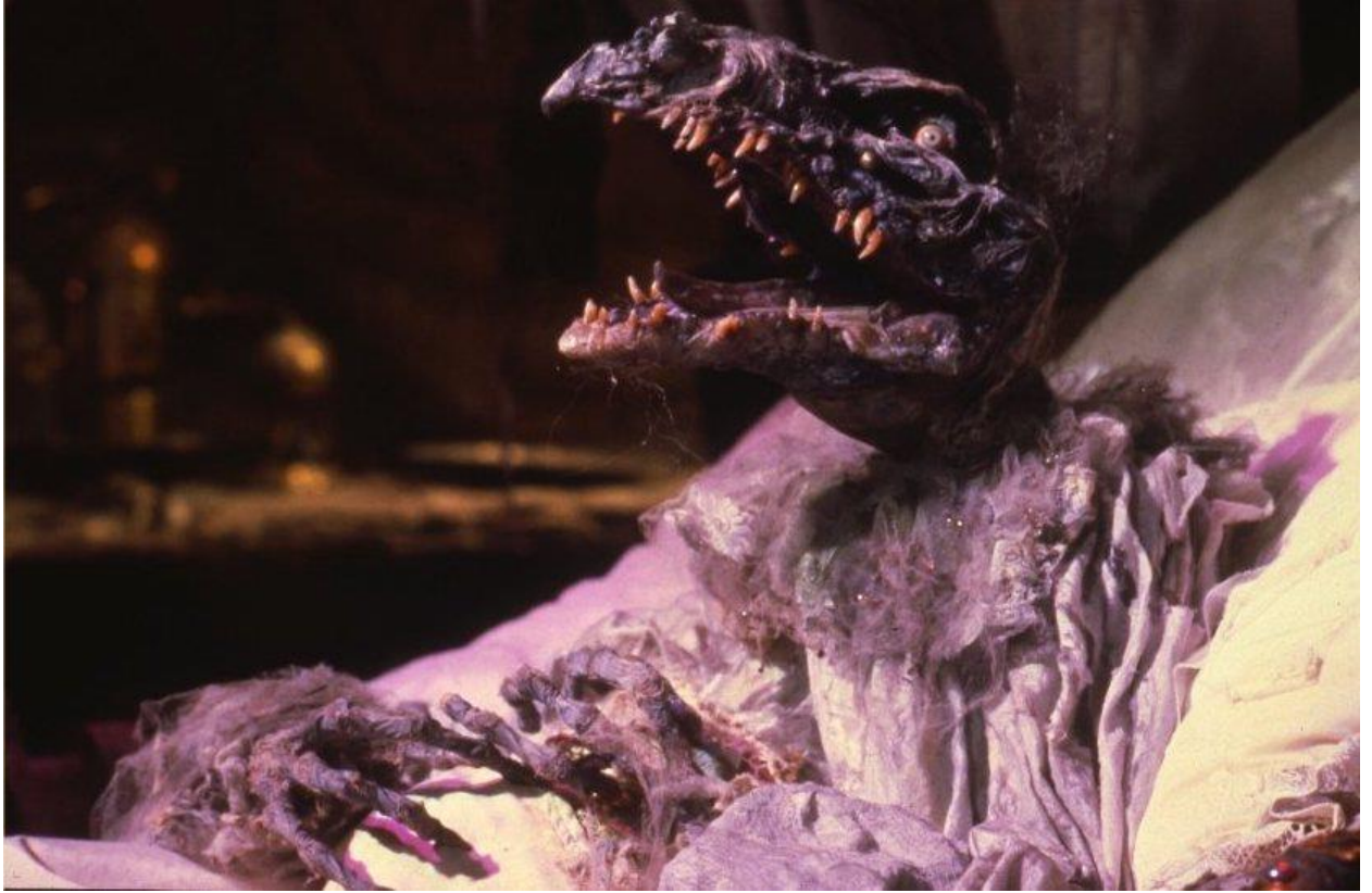
Fig. 13. skekSo the Emperor .