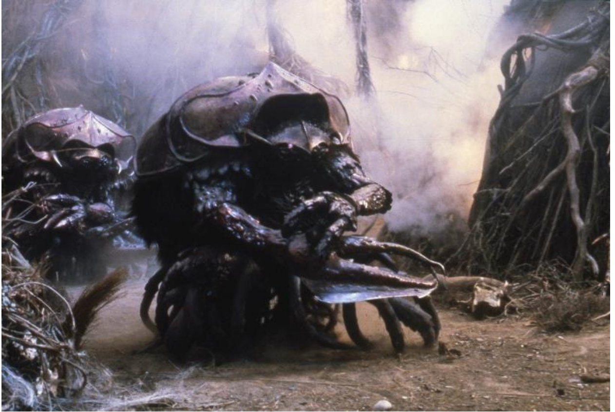
Fig. 23. Garthim . http://www.darkcrystal.com/galleries_dark-creatures.php (accessed on March 5, 2019) © The Jim Henson Company