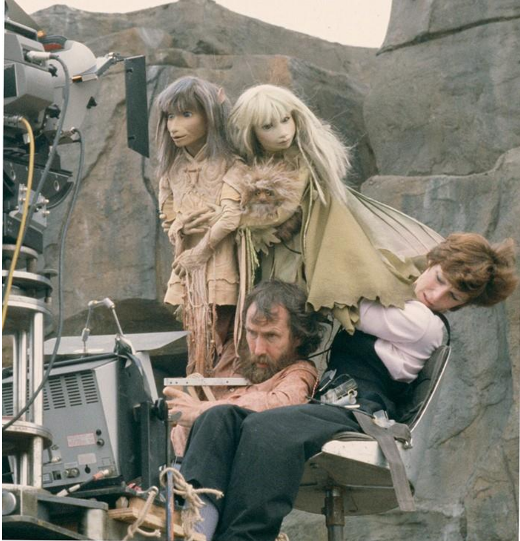
Fig. 11. Henson and Kathy Mullen perform Jen and Kira in The Dark Crystal. Murray Close, 1981. The Stranger. https://www.thestranger.com/art-and-performance-fall-2017/2017/09/06/25388361/the-genius-and-generosity-of-jim-hensons-work (accessed on April 8, 2019) © The Jim Henson Company