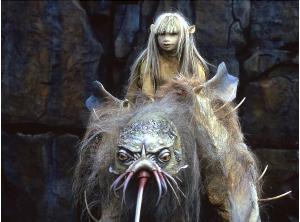
Fig. 21. Kira with Fizzgig riding atop a Landstrider. http://www.darkcrystal.com/galleries_thra-creatures.php (accessed on March 5, 2019) © The Jim Henson Company