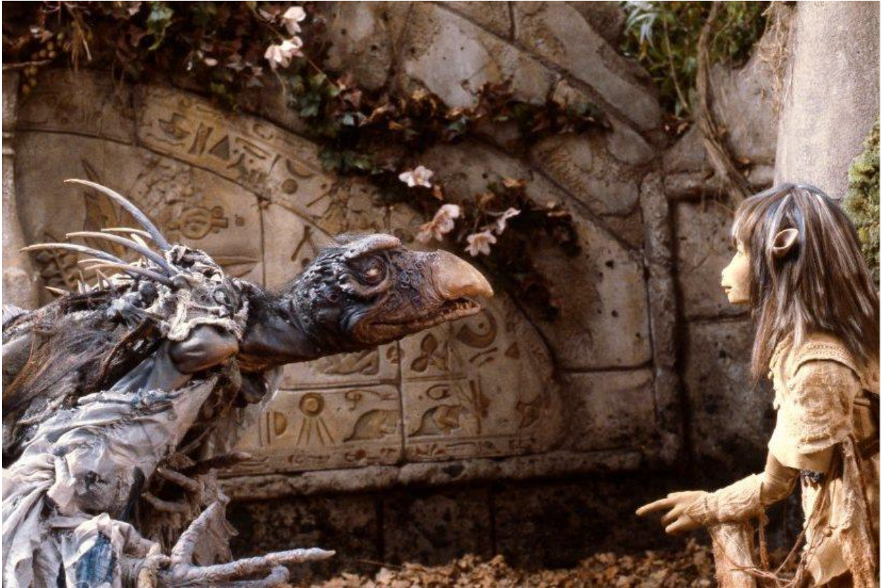
Fig. 17. The Chamberlain approaches Jen at the House of the Old Ones.

http://www.darkcrystal.com/galleries_skeksis.php