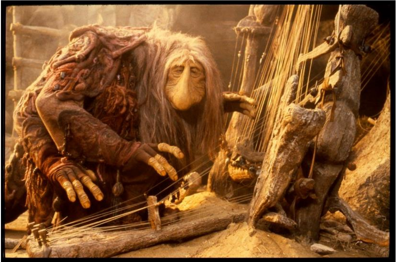
Fig. 9. urrUt the Weaver with an urRu instrument. http://www.darkcrystal.com/galleries_urru.php (accessed on March 5, 2019). © The Jim Henson Company