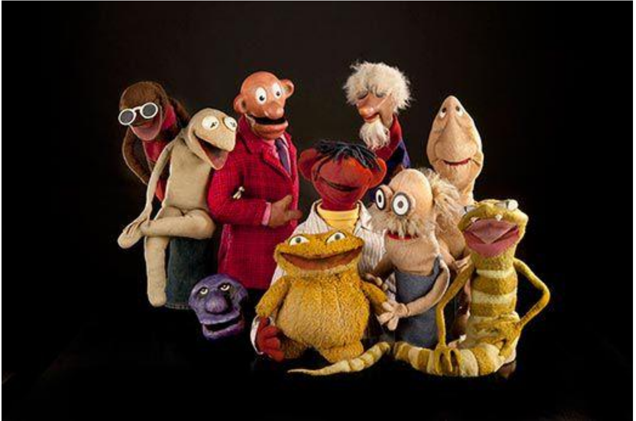
Fig. 5. Richard Strauss, Cast of Sam and Friends . The Smithsonian Museum of American History. https://www.smithsonianmag.com/smithsonian-institution/kermit-the-frog-and-friends-join-american-history-museums-collections-506415/ (accessed on April 10, 2019)