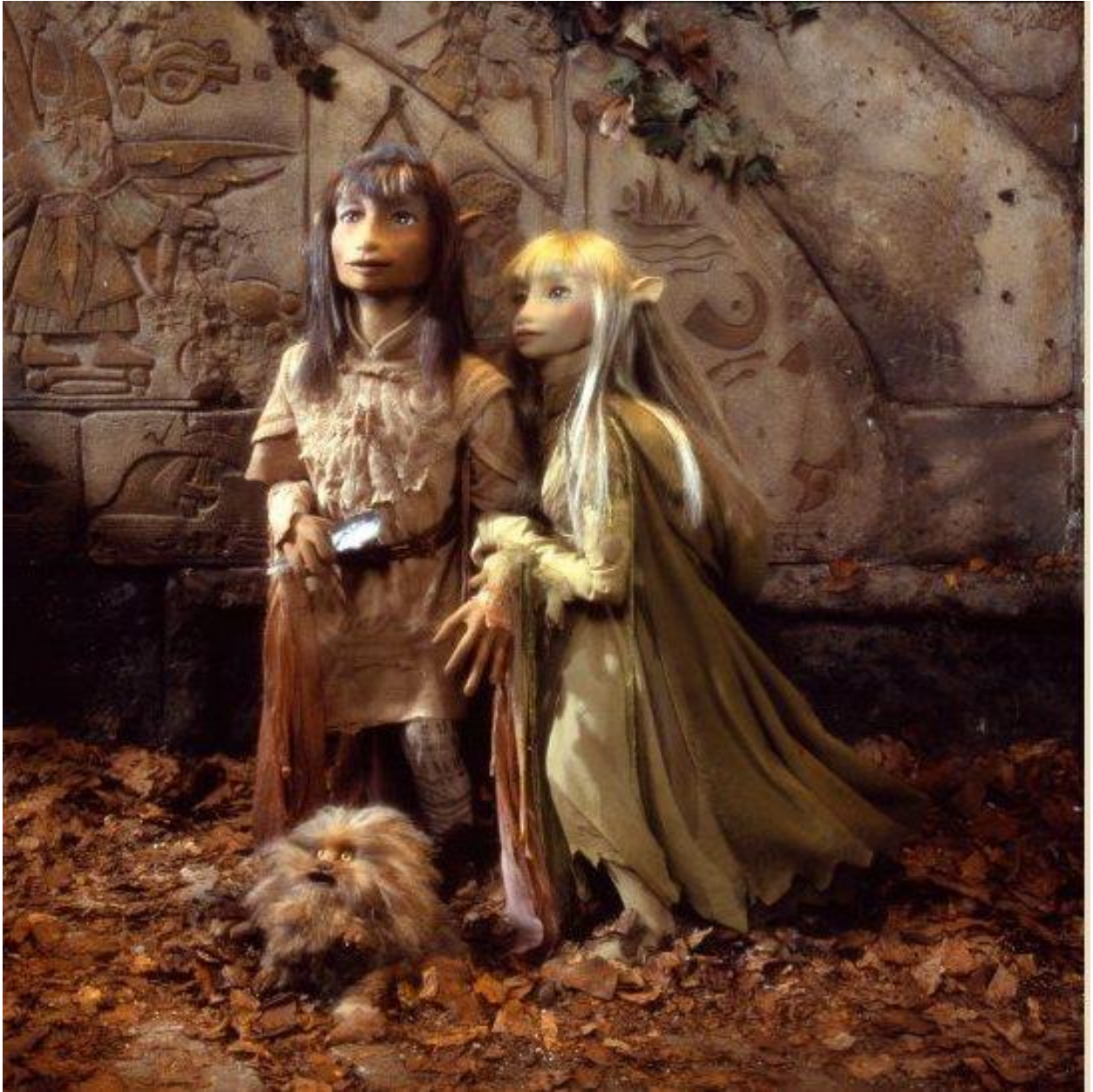
Fig. 10. Jen, Kira, and Fizzgig in front of the Wall of Destiny. http://www.darkcrystal.com/galleries_jen-kira.php (accessed on March 5, 2019) © The Jim Henson Company