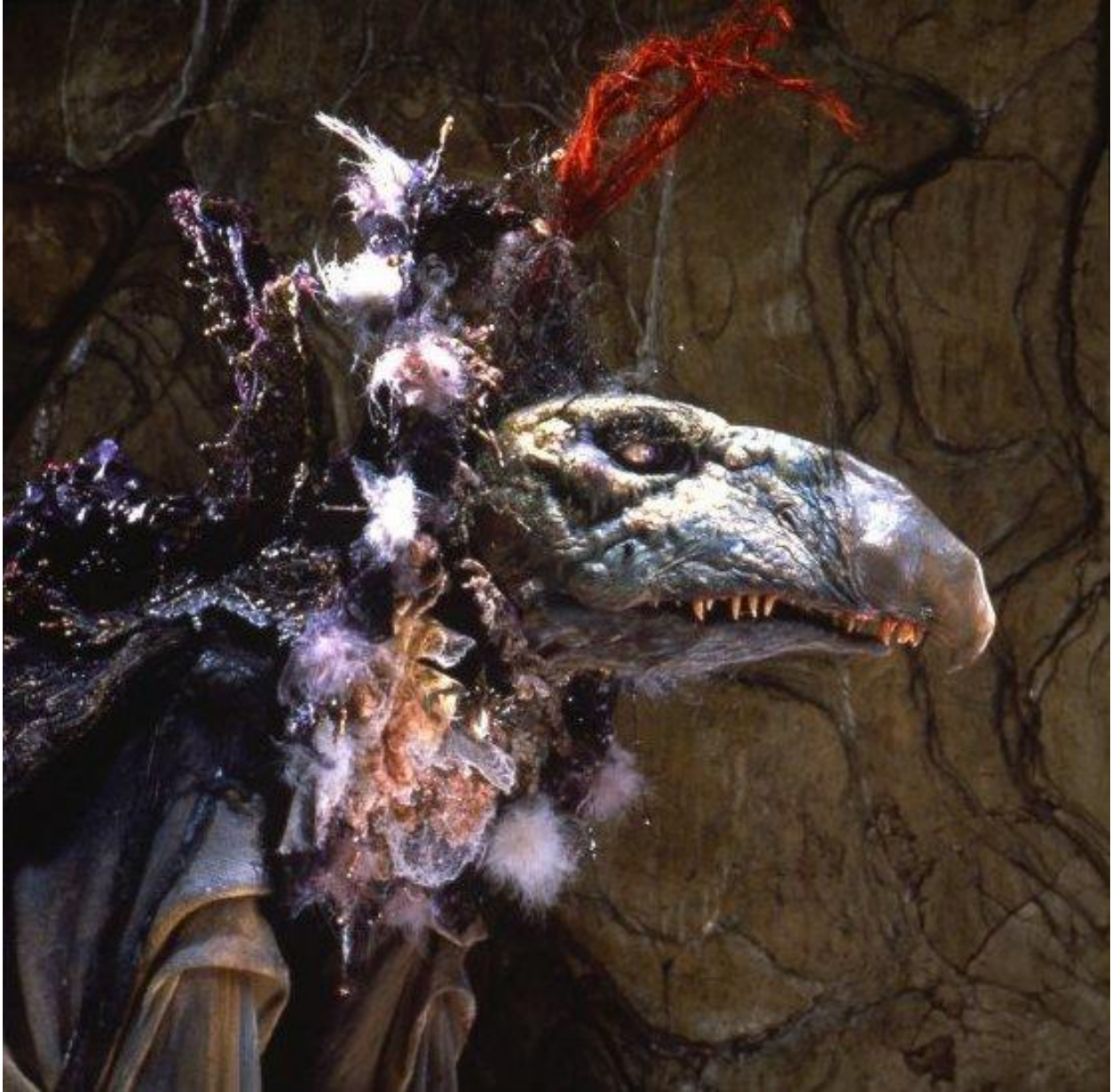
Fig. 12. skekEkt the Ornamentalist.. http://www.darkcrystal.com/galleries_skeksis.php (accessed on March 5, 2019) © The Jim Henson Company