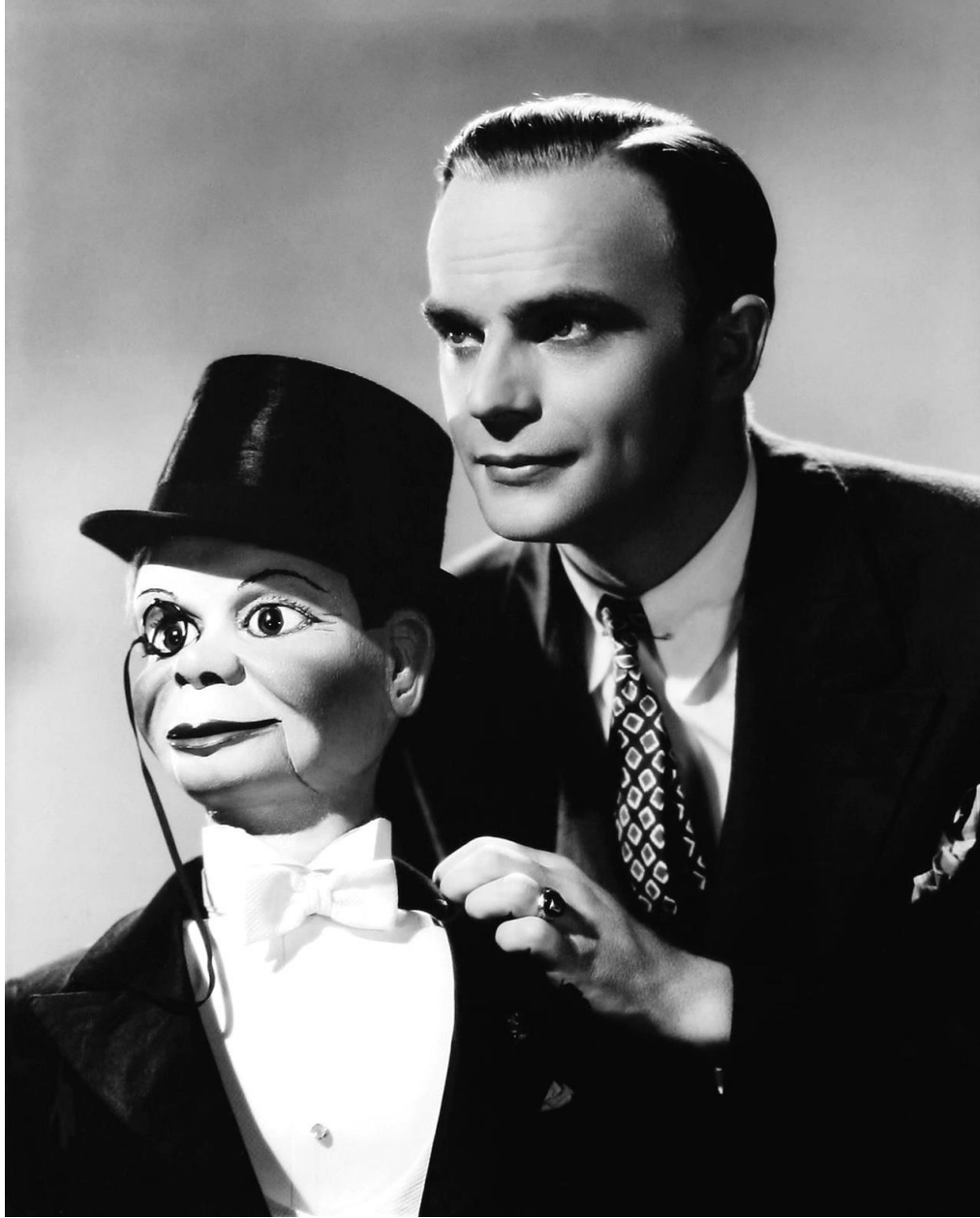
Fig. 4. Edgar Bergen. UNIMA: The World Encyclopedia of Puppetry Arts. https://wepa.unima.org/en/edgar-bergen/ (accessed on April 10, 2019).