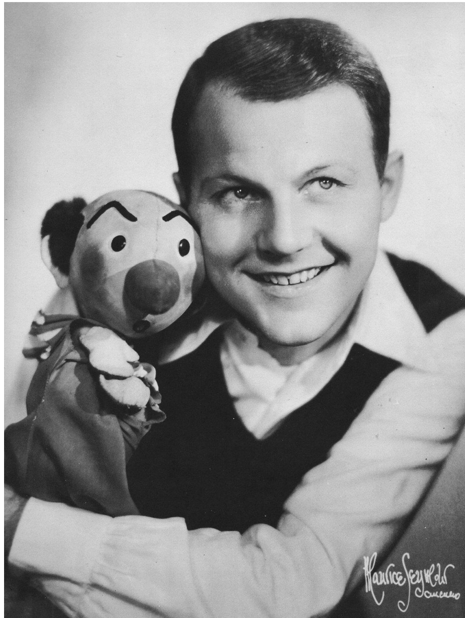
Fig. 6. Burr Tillstrom . UNIMA: The World Encyclopedia of Puppetry Arts. https://wepa.unima.org/en/burr-tillstrom/ (accessed on April 10, 2019).