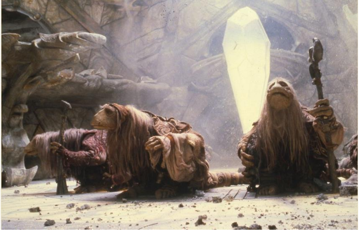
Fig. 19. urRu encircle the Crystal.