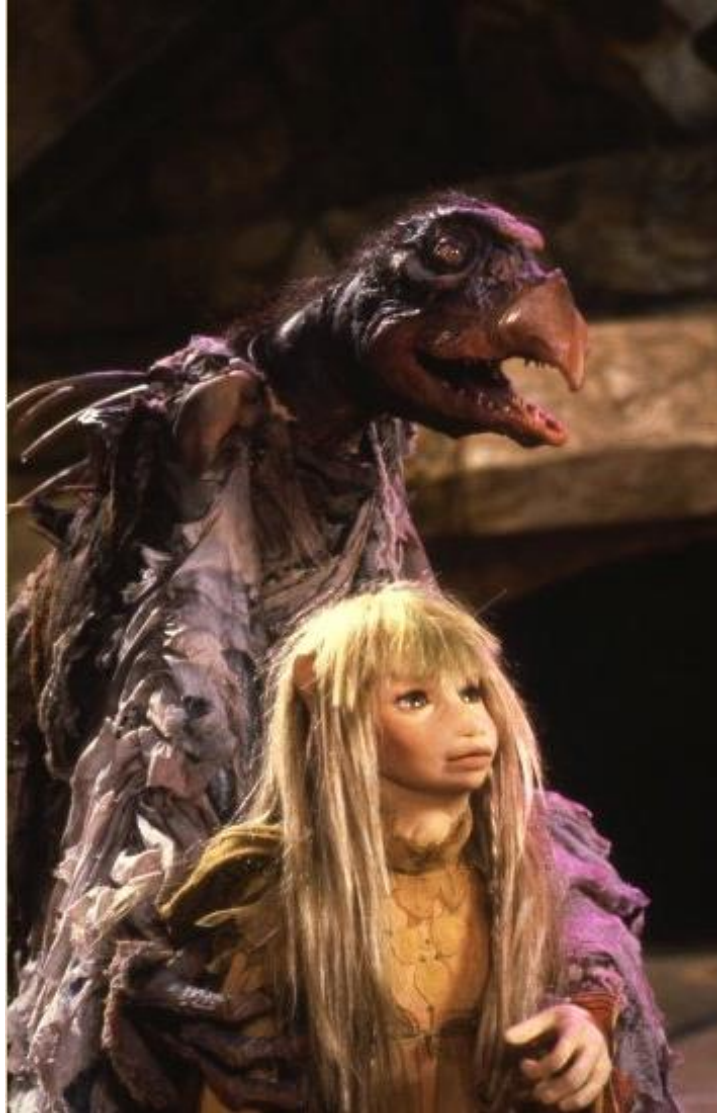
Fig. 18. The Fallen Chamberlain and the Captured Kira.