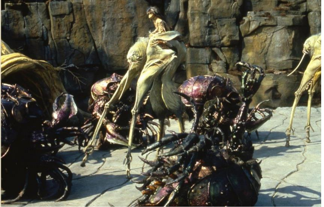
Fig. 22. Jen riding atop a Landstrider during a battle with Garthim soldiers. http://www.darkcrystal.com/galleries_thra-creatures.php (accessed on March 5, 2019) © The Jim Henson Company