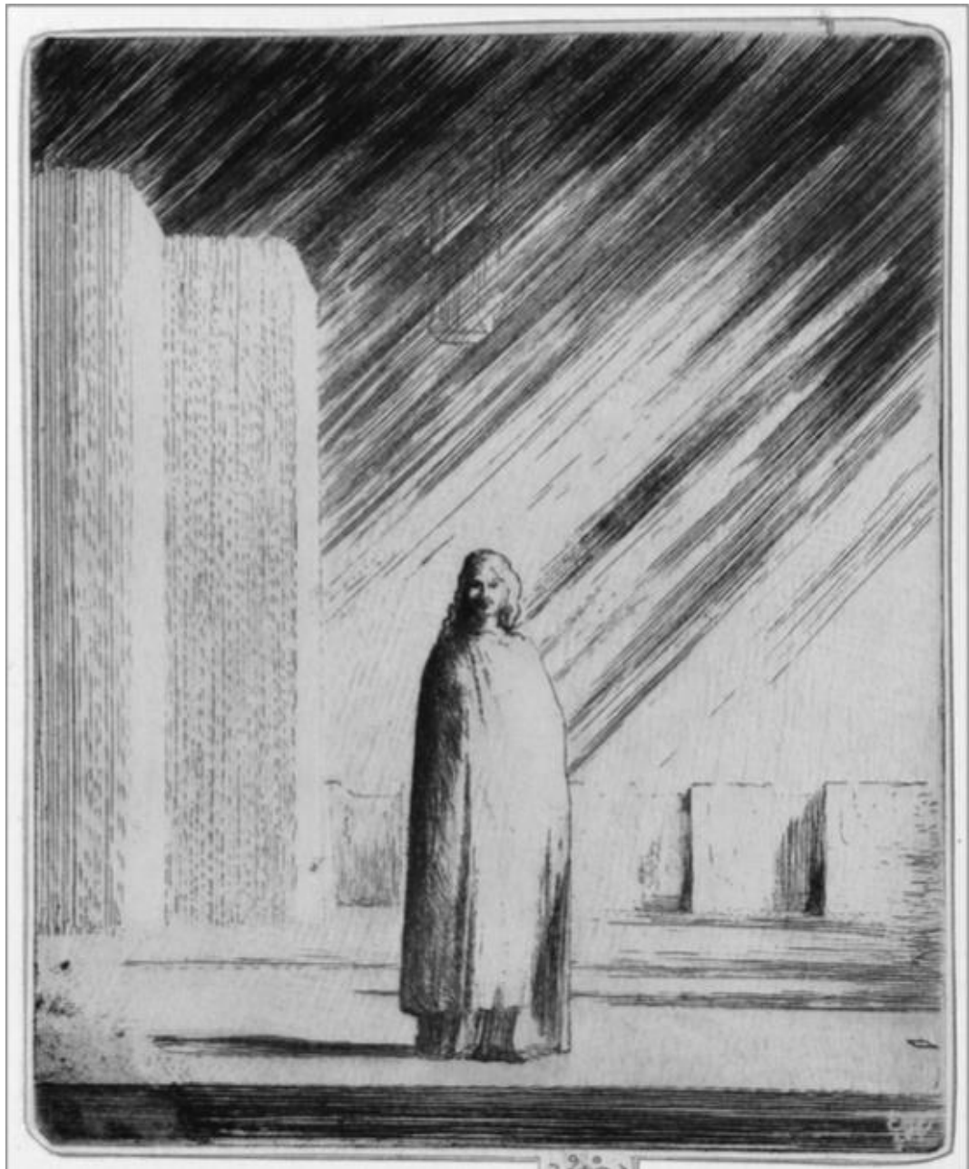
Fig. 2. Edward Gordon Craig, Über-Marionette , 1907. BnF ASP, EGC ICO 764 (31).