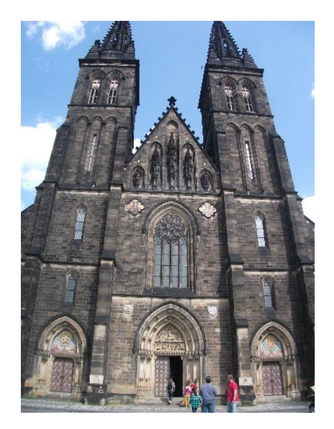
Vysehrad, Summer 2014, Photo by author.

simply stopover in Prague for a few days and move on to the next European capital is to miss out on all the Czech Republic, and the many other wonderful experiences the nation, has to offer. There are several popular sites to see while in the capital: Prague Castle ("Prazsky hrad"), Charles Bridge, the astronomical clock ("Orloj"), Wenceslas Square, the Jewish synagogue and cemetery, and Vysehrad (which roughly translates to "tower castle") are just a few.