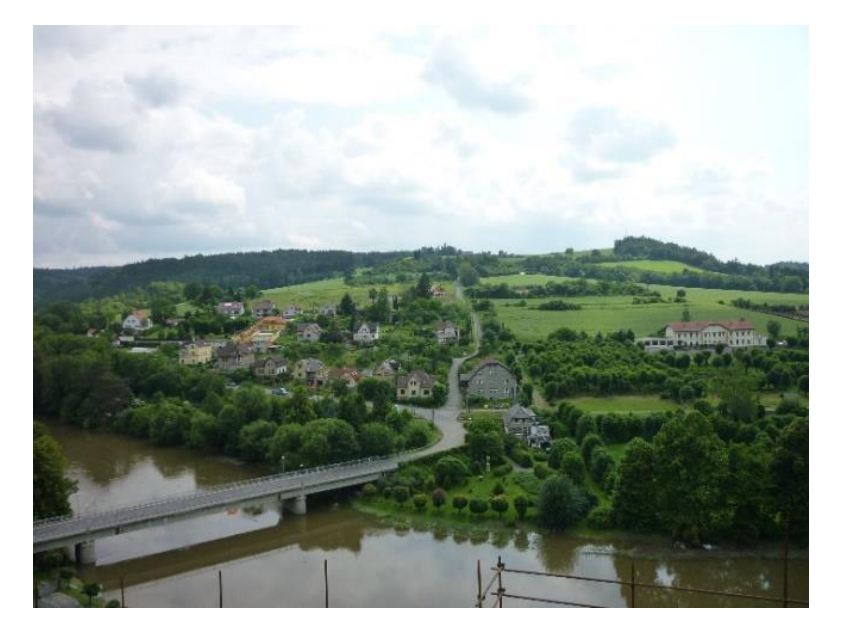
View from Sternberg Castle Tower, Summer 2014, Photo by author.

Another quaint bohemian town located about thirty miles east of Prague is Podebrady, which translates to English as "below the ford." What makes this a worthwhile day trip destination is that it is considered a spa and health center for the nation. The most fascinating feature is the natural spring that provides the town with