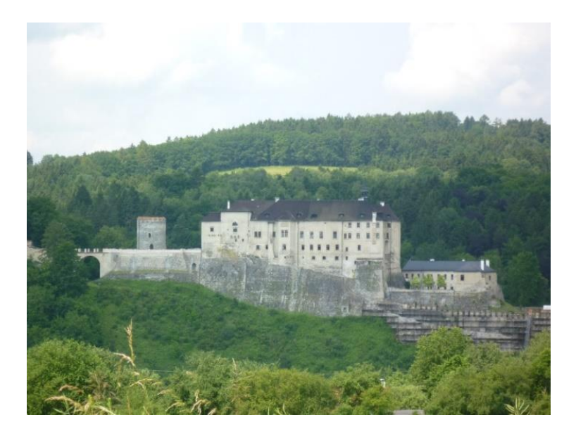
Sternberg Castle, Summer 2014, Photo by author.