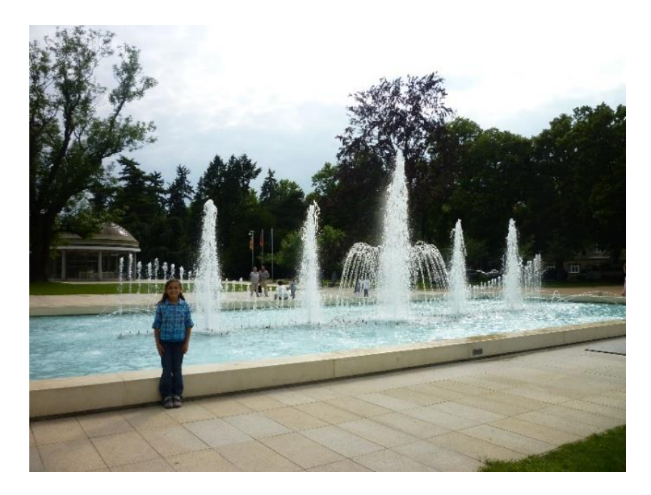
Podebrady fountains, the public building with free mineral spring water is in the back left, Summer 2014, Photo by author.

Central Bohemia has greatly changed between my two visits. It is truly amazing what a quarter century and a change in government can do to reawaken a region and its people. With such a rich history and culture, it was inspiring to see both the country and people flourishing after years of stagnation under communistic governance. In my revisit to Prague and Central Bohemia, I saw a nation and people full of hope, newfound inspiration, and freedom. I encourage readers to consider visiting the country and experience the Czech Republic for themselves.