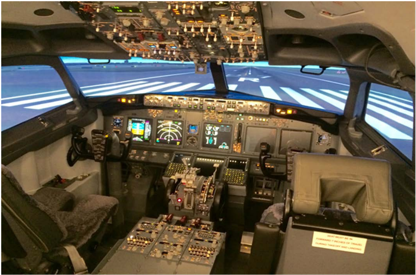
Figure 1 – Highly Complex Multi-Faceted Boeing 737-800 Simulator

The correct use of these information systems by the aircraft pilot will all have an impact on the success of the flight, lowers risk, and ensures the safety of all those aboard. As well as interacting with the information systems, each pilot worked alongside a co-pilot who would provide support and information relating to navigational data and specific weather patterns. Each pilot was also required to operate with an air traffic controller who would relay information to the pilot and request information about specific incidents from the pilot. All four pilots were experienced in the aviation field with each pilot having hundreds of hours' experience operating the Boeing 737-800 simulator, class room based aeronautical training, and live flying experience of a light aircraft. Whilst operating the Boeing 737-800 simulator the pilot was being observed and graded by an experienced flight instructor. The flight instructor would grade the students on: (i) verbal communication with their co-pilot and air traffic control; (ii) navigational ability; (iii) take-off and landing scenarios; (iv) interactions with the information systems; (iv) hazardous flying scenarios; and (vi) life threatening scenarios. The pilots were awarded a score from 1 -10 based on their performance levels in each category whilst operating the Boeing 737-800 simulator.