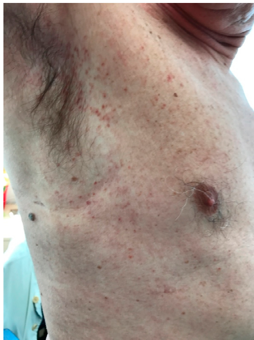
Figure 1. Maculopapular skin lesion, affecting mainly arms and trunk.

years. Skin lesions (Figure 1), which were partially responsive to sun exposure or phototherapy, were similar to those usually observed in urticaria pigmentosa (although without the itching). On physical examination there was no evidence of lymphadenopathy, nor were any other clinically relevant findings appreciable.