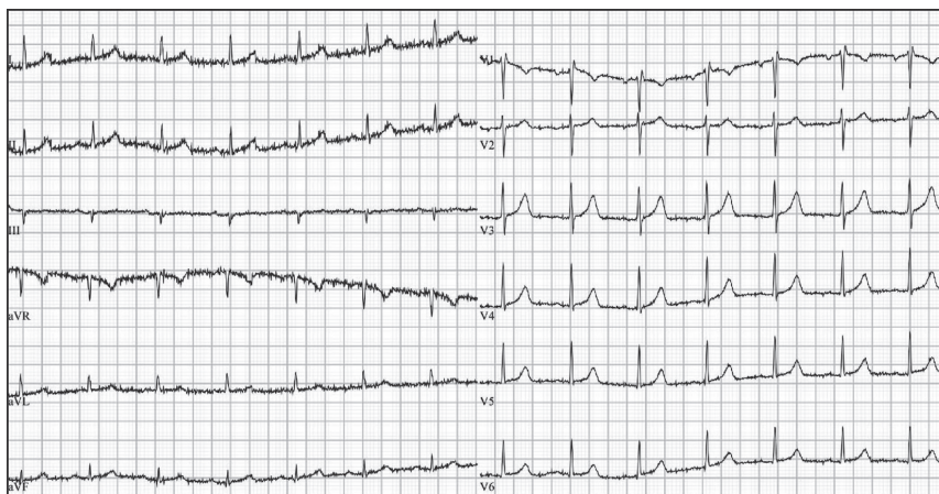
FIGURE 2. ECG at the Emergency department presentation: a sinus rhythm of 75 beats per minute with an intermediate heart axis without any conduction abnormalities. No ST elevation or depression and normal T-wave morphology.

Therefore, the clinician decided to supplement the patient with 40 mmol potassium orally to prevent serious rhythm abnormalities. In addition, 2.25 mmol calcium gluconate was supplemented intravenously based on the low concentration of calcium analysed from the same blood sample. To investigate whether the hypokalaemia and hypocalcaemia caused cardiac conduction disturbances an electrocardiogram (ECG) was performed. However, no abnormalities consistent with low potassium or low calcium were observed (Figure 2).