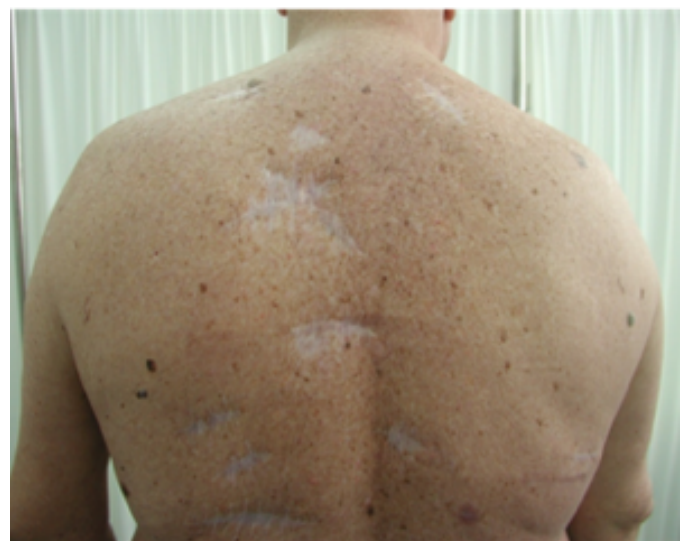
Figure 1. and Figure 2. 84-year-old male patient with dysplastic nevus syndrome and history of multiple primary melanomas

dysplastic nevi removed. Patient history revealed the patient had worked in a paint factory for many years, and had several blistering sunburns when younger. Family history is positive for melanoma, three sisters and a brother also had melanoma, while his father died of leukemia. Gene mutation analysis performed in 2011 of the p16 gene (melanoma susceptibility gene) was negative. The patient was regularly monitored every six months (since the removal of melanoma of the palpebra once more every three months) and his evaluation included dermatologic and ophthalmologic examination, LDH, S100B, basic laboratory tests, ultrasonography of regional lymph nodes, postoperative scars, and when necessary, excision of atypical lesions on the skin.