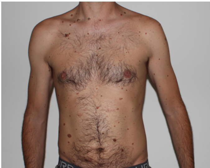
Figure 3. 45-year-old male patient with dysplastic nevus syndrome