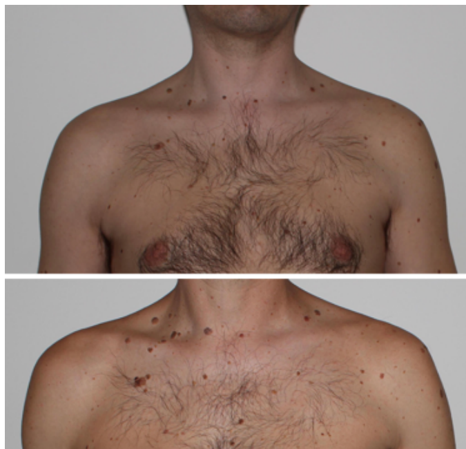
Figure 4. Four years after the first primary melanoma was removed, a newly discovered dark pigmented macula of about 5 mm in size was observed at the upper edge of a congenital nevus located on the skin in the right supraclavicular area during digital total-body photography follow-up

nevus syndrome (Figure 3), apart from regular dermatologic examination, the patient is also monitored with digital dermoscopy (total-body photography and sequential digital dermoscopy imaging) and, when necessary excision of atypical lesions is performed. Four years after the first primary melanoma was removed, a newly discovered dark pigmented macula of about 5 mm in size was observed at the upper edge of a congenital nevus located on the skin in the right supraclavicular area during digital total-body photography follow-up (Figure 4). The lesion