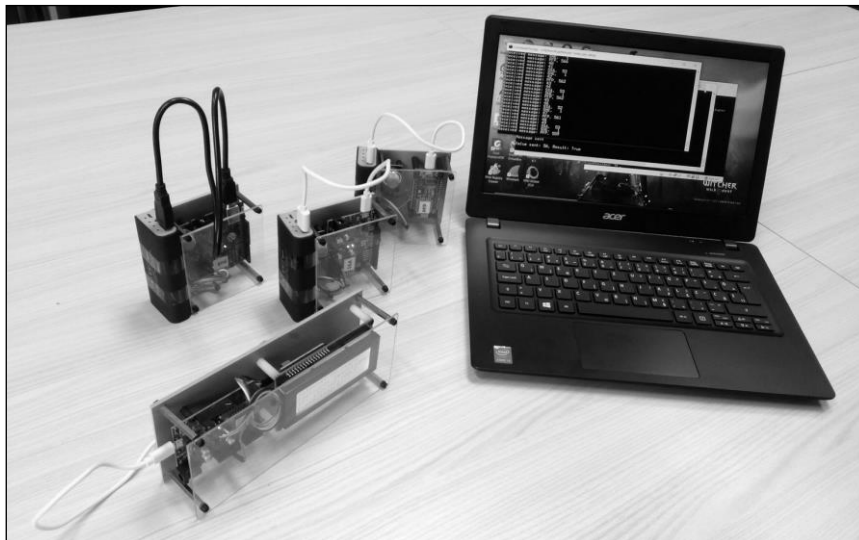
Figure 4. The learning system in testing period.

The platform was in test usage four times for about five hours. During this period, the platform worked without any problems. Based on the operation of the platform during the testing phase, it can be concluded that the platform is stable and it works correctly. Regarding the easiness of using the platform, it was concluded that the platform is suitable for usage in the classroom, for demonstrating the functioning of publishing/subscribe protocols, as well as for the students' collaborative work on the development of microservice-based applications.