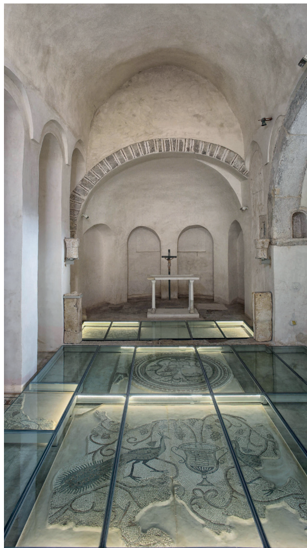
Fig. 3. St John's Church in Stari Grad.