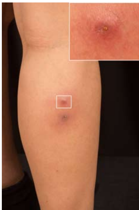
Figure 1. Furuncular lesions on the lower leg. The inset depicts a close-up view of the upper lesion with its central opening.

A 35-year-old Caucasian woman, otherwise healthy, presented with a four weeks history of painful, inflammatory nodules, each with a central opening on her right lower leg (Figure 1). Intermittently, a marked serosanguinous secretion was noted. The remaining skin and mucosa were not affected. The patient denied any history of trauma. One month earlier she had returned from a journey to Peru. Despite topical treatment with corticosteroids and antibiotics as well as systemic therapy with oral doxycycline, the lesions did not show any regression or reduction in their secretion. An incisional biopsy was performed at all sites and the extracted organic specimens were submitted for histopathological assessment. Histopathology revealed a mixed inflammatory dermal infiltrate consisting of numerous eosinophils admixed with some histiocytes and lymphocytes. Furthermore, an organic foreign body with an eosinophilic cuticle consistent with DH became evident (Figure 2, a-e).