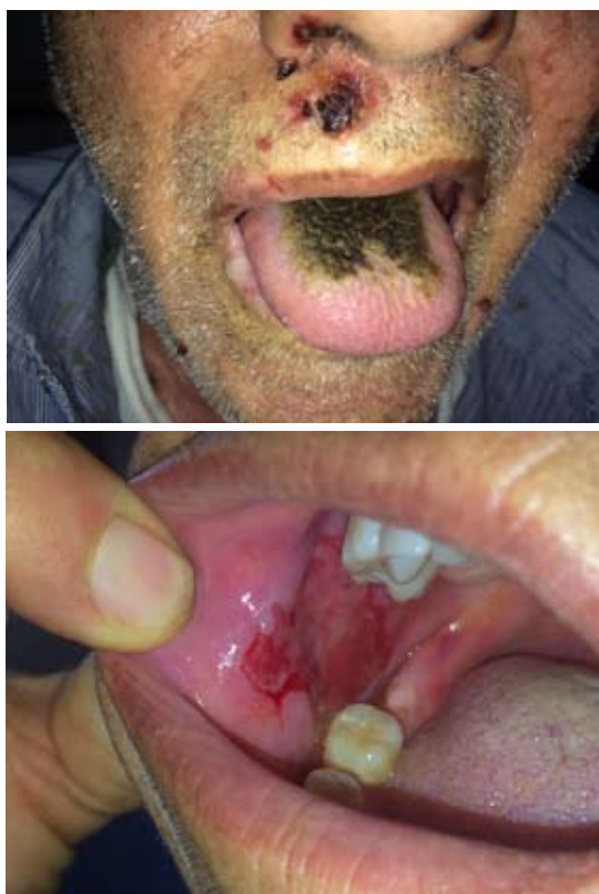
Figure 1. Lesions and oral candidiasis (black hairy tongue) in patients with pemphigus.

Genomic DNA was extracted through the boiling method described by Makimura et al. (8) with small modifications. Briefly, a small amount of the yeast colony was suspended in 100 µL of lysis buffer containing 100 mM Tris-HCl, 0.5% SDS, and 30 mM EDTA and boiled for 15 min at 100°C. A solution of potas-