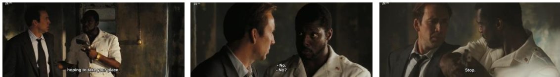
Picture 7-9 (Scene 01:18:18--01:21:04): Baptise offers Yuri his revenge, but Yuri's Superego hold his desire to kill (attachment 3)

“stop” but unfortunately, it is right after Baptise pulls the trigger and kills Simone. Based on the Freud (1923) psychoanalysis theory, what Yuri has done by showing a hesitate in his action and replying “no” when he is asked to kill Simone and “stop” when Baptise shoots Simone are based on his Superego. The Superego will tend to hold the desire of the Id of a person or individual and makes the person to do something based on moral and rational.