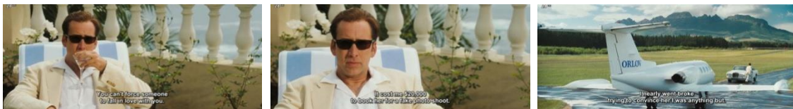
Picture 4-6 (Scene 00:28:41 – 00:31:25) : Yuri monologue about how he spent his money to deceive Ana (attachment 2)

Later, in the next part of the movie, Yuri's Id not only chases for money but also chases for woman. There is a woman that Yuri admires most in his life. She is Ava Fontaine a model and an artist in his country. Yuri knows that to get to know her, he has to spend a lot of money, so he decides to rent a whole hotel as well as a private jet to convince Ava that he is a rich man and works in a transportation business (scene 00:28:41 – 00:31:25). In doing so, he says that he is almost broken even though he knows that Eva is not a women that craving for wealth or money. He thinks that a successful relationship is build by deceit and lies, because he believes that deceit and lies are where most relationship will end as his justification. At this scene, his Id has been controlling the whole personality of Yuri to make his Ego to do what the Id wants. His Id makes Yuri spend a lot of money just to deceive Ava to think that he can be her ideal man.