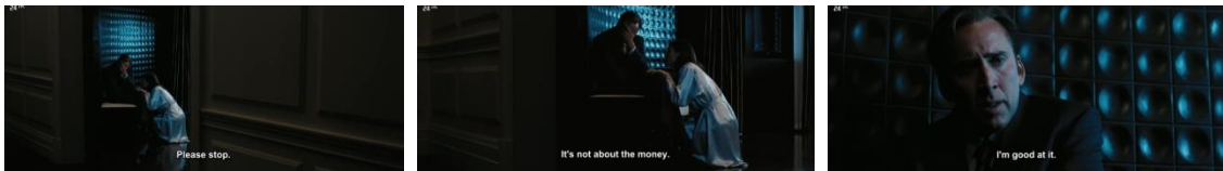
Picture 10-12 (Scene 01:28:30 – 01:28:38): Yuri finally tells his Ava everything about his business, but he tells her that it is hard for him to stop (attachment 4)

it”(taken from scene at 01:28:30 – 01:28:38). After that, Yuri tries to stop selling guns and being a good father and husband for his child and his wife. From the dialogue above, Yuri’s Superego has successfully hold the desire his Id as a gun dealer and with the help of people near to him and he decides to do a clean business for his wife. His decision in the term of Super Ego is based on the morality and an ideal Ego.