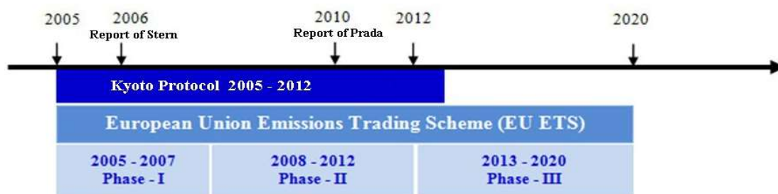
Figure 1. Overview of regulations governing carbon finance

Following this principle, it can be asserted that the real objective of the EU ETS to offer incentives to industrial firms to reduce their CO 2 emissions and thus encourage the adoption of low-carbon technologies, to develop Efficiency Energy (EE), Renewable Energies (Renewable Energies) and the low carbon economy (Capoor and Ambrosi, 2009). We give an overview of the regulations governing Carbon Finance (Bokenkamp, La Flash, Bachrach Wang, 2005).