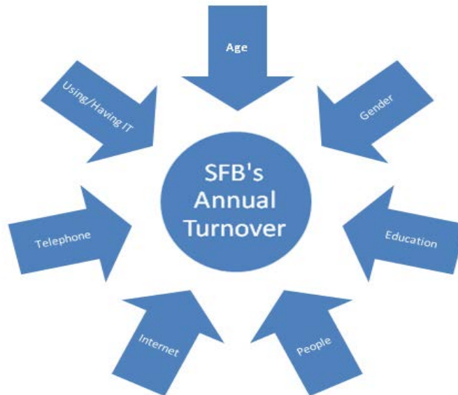
Figure 1. Socio-economic factors

Therefore, the main aim of this study is to identify and analyze the IT users performance in small family businesses (SFBs) in districts in Lumbini Zone of Nepal (see Figure 2). Also, identify the factors those are huddle for SFBs in terms of adopting IT and removing the gap between SFBs and government which is believed to be the principal cause of government failure in the management of SFBs and build a social awareness in order to help SFBs by increasing their annual turnover. In following sections we briefly discuss factors those are listed in literatures and develop hypothesis for this study.