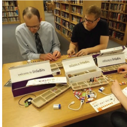
Figure 3. UW faculty members and pre-service teachers explore kits containing electronic components.

If you want to reinforce STEM skills at your library, materials that will be the most popular and useful are those that can be used in numerous ways. Selecting versatile kits will allow for more program creation and offer a low-cost approach to getting started with STEM in your school library. Talking to other librarians and teachers to learn what kits they know about and what they'd be interested in using can provide valuable inspiration for purchases. Many of these kits are not reviewed in traditional sources, so partners will become your best reviewers and recommenders.