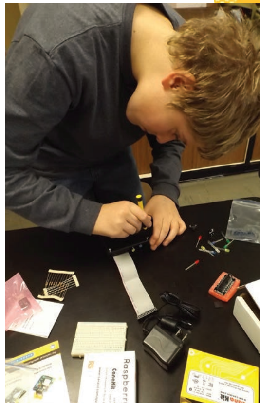
Figure 1. A UW Lab School student assembles a Raspberry Pi kit.