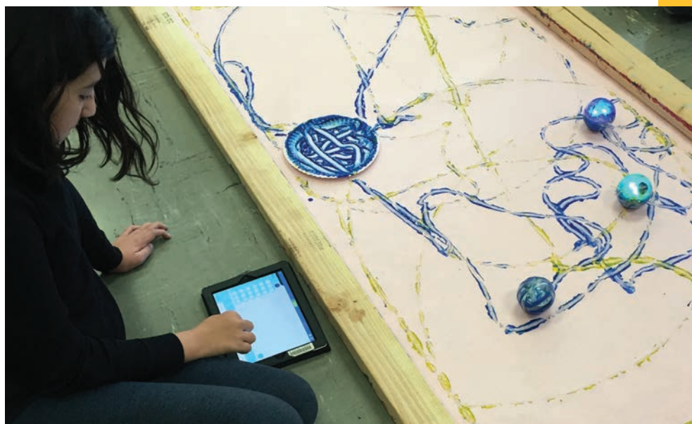
Figure 6. Student "painting" by controlling Sphero robots.