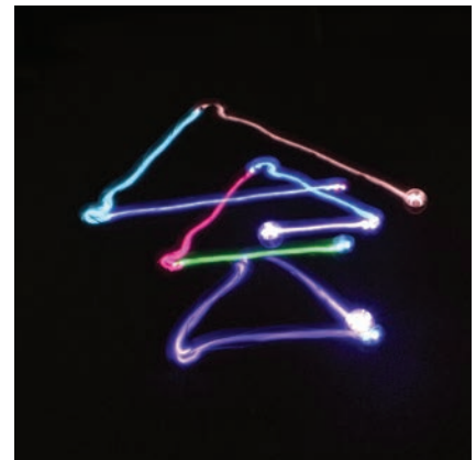
Figure 5. Examples of "light painting" with Sphero robots and a slow-shutter-speed camera.