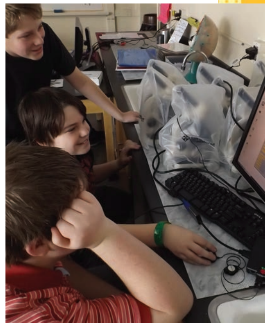
Figure 2. UW Lab School students program Raspberry Pi computers.