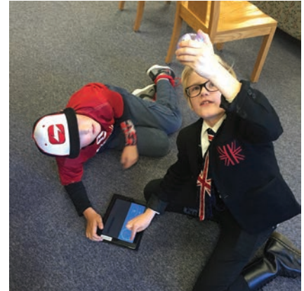
Figure 4. Lab School students discover how to control a Sphero robot.