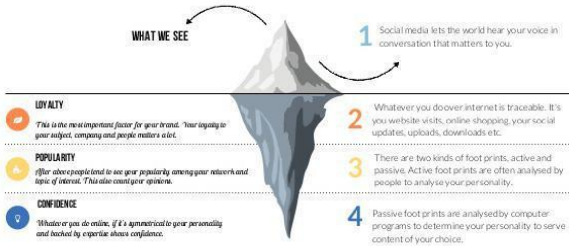
Figure 1: Illustration of Digital Footprint Definition

There are two types of digital footprint which are passive and active digital footprint (McDermot, 2018). A passive digital footprint is a data trail or information path which user inadvertently leave online. For instance, when the user visit a website, IP address may be logged on to the webserver, which then identifies Internet service provider and user approximate location. Although the IP address may change and does not include any personal data, it still remains part of users' digital footprint. Search history, which is saved by some search engines when user logs in is a more private element of the passive digital footprint. Meanwhile, an active digital footprint involves information that user submit online deliberately. Example one of the activities that contribute to an active digital footprint is sending an email, as user expect other individuals to view and/or save information. The more email sent, the more digital footprint grows. Since most people save their email online, the emails can readily stay online for several years or longer. Individuals who are not trained on digital footprints and do not have the required knowledge or abilities to depict a favourable Internet presence may have a potential disadvantage.